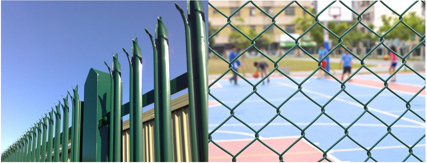
Chain Link Fence