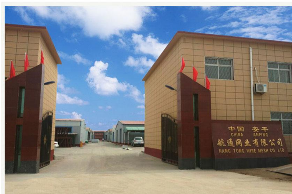
HANGTONG Factory Gate