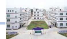
Shenzhen/ China (Fuyong)