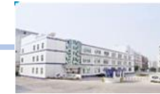
Shenzhen/ China (Baoan / Huili)

Resilient production supported by 6 manufacturing sites across China, Taiwan, and Vietnam.