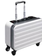
Energy Storage System