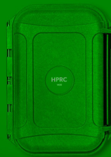
Test sample under IR laser illumination (850 nm) without special masterbatch and long fiber compound