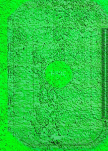
Test sample on cement under IR laser illumination (850 nm) with special masterbatch and long fiber compound