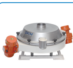
Vibrating Control Screeners