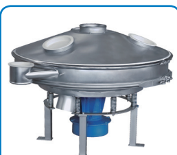
Vibrating Tumbler Screeners