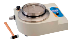
Laboratory Air-Jet Lab-Sieves