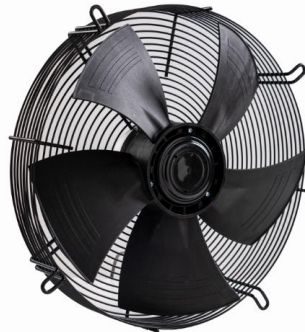
AC and EC Axial Fan