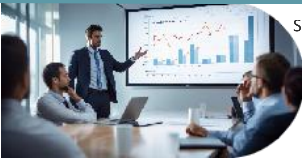
Shaded Pole、ECM Motors