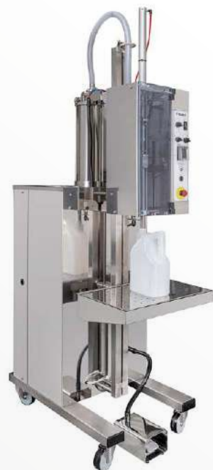
Semi-automatic filling machine