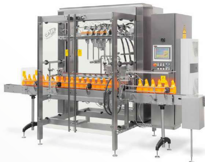
Linear automatic filling machine