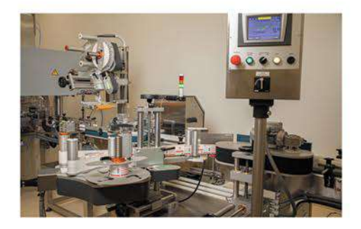
Labelling / Coding