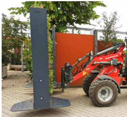
The mobile gabion can be transported with a forklift, wheel loader or pallet truck.