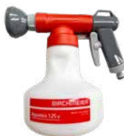
Birchmeier Aquamix fertiliser sprayer