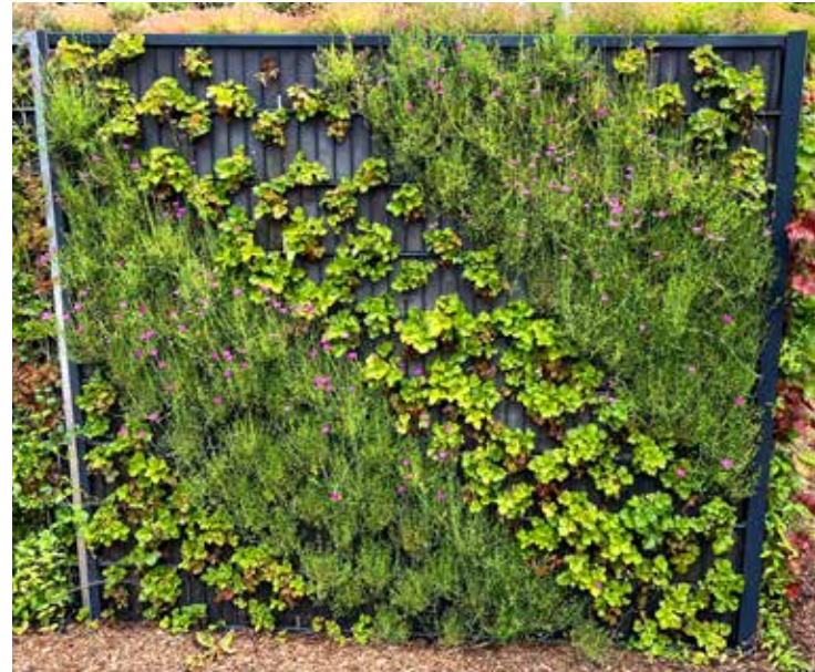
Growth plus: great results after approx. 2 months