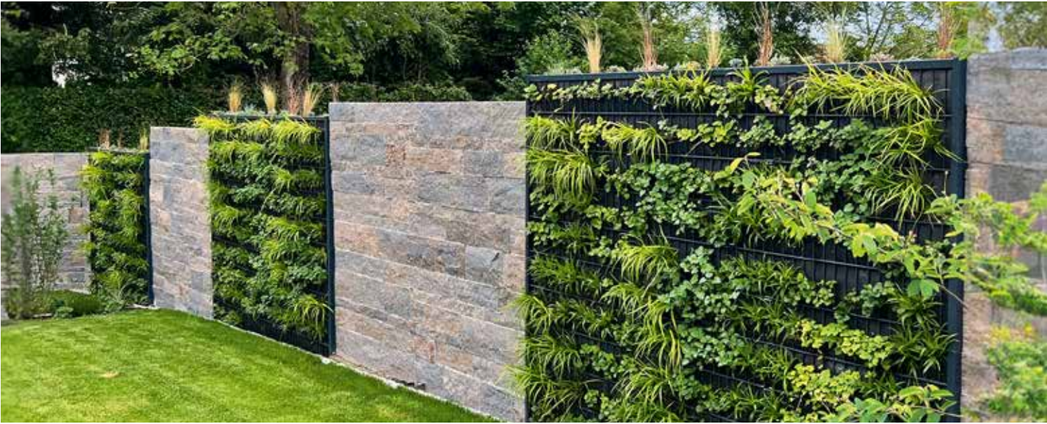
The RANKO Pflanzengabione is available with planting on one or both sides (depth approx. 20 cm or 30 cm).