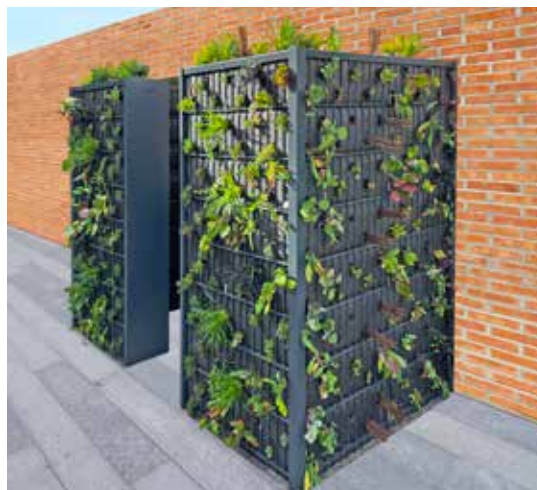
Aesthetics with function: corner gabions with corner elements

Ask about other versions, such as the RANKO Pflanzengabione tub or the RANKO Pflanzengabione waste bin enclosure .