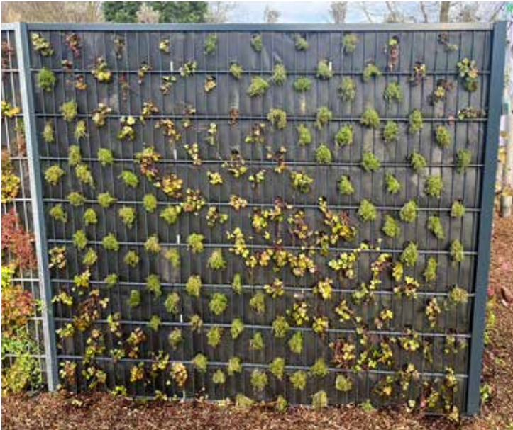
Freshly planted already a stylish sound and privacy screen