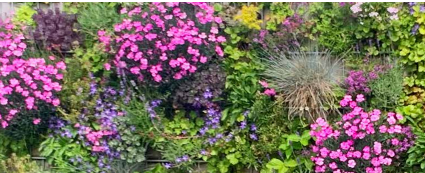
The RANKO Pflanzengabione – the variety of plants leaves nothing to be desired.