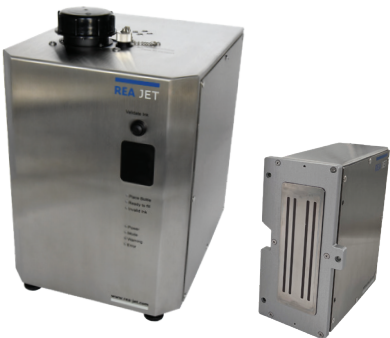
Ink supply unit With print head