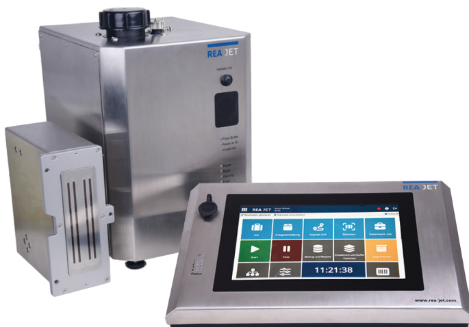
REA JET UP with Touch Controller and ink supply unit

The rugged and at the same time compact device design allows for easy integration into any product line. It also makes it suitable for Industry 4.0, which is a matter of course for REA JET.