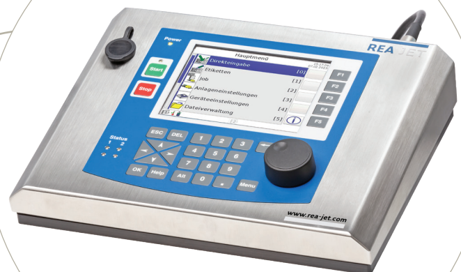
REA JET Universal Controller