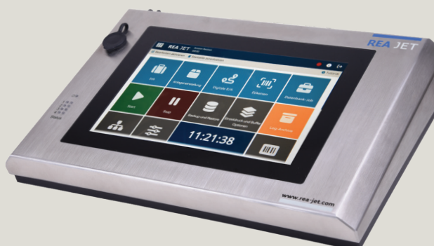
REA JET Universal Controller Touch