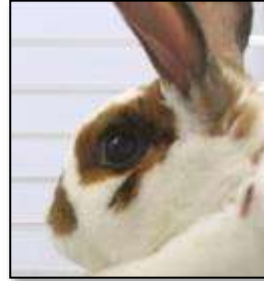
Small Animal & Rabbits