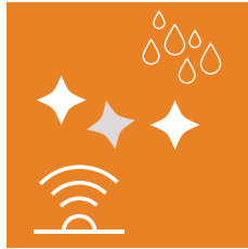
Spark extinguishing systems