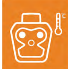
Infrared early fire detection