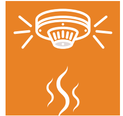
Fire alarm systems