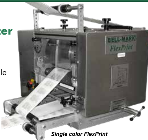
Single color FlexPrint