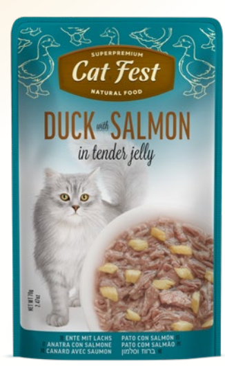
COMPOSITION: duck 54%, duck broth 38%, salmon 6%, yeast extract, fructo-oligosaccharides, anchovy fish oil, salt. ADDITIVES: Nutritional Additives: Vitamin E 800 mg/kg, Taurine 800 mg/kg