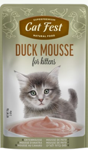
COMPOSITION: duck 58%, duck broth 39.9%, yeast extract, fructo-oligosaccharides, anchovy fish oil, salt. ADDITIVES: Nutritional Additives: Vitamin E 800 mg/kg, Taurine 800 mg/kg