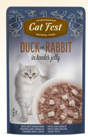
COMPOSITION: duck 54%, duck broth 38%, rabbit 6%, yeast extract, fructo-oligosaccharides, anchovy fish oil, salt. ADDITIVES: Nutritional Additives: Vitamin E 800 mg/kg, Taurine 800 mg/kg