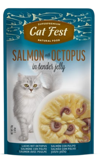
COMPOSITION: salmon 54%, salmon broth 38%, octopus 6%, yeast extract, fructo-oligosaccharides, anchovy fish oil, salt. ADDITIVES: Nutritional Additives: Vitamin E 800 mg/kg, Taurine 800 mg/kg