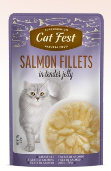
COMPOSITION: salmon 58%, salmon broth 40%, yeast extract, fructo-oligosaccharides, anchovy fish oil, salt. ADDITIVES: Nutritional Additives: Vitamin E 800 mg/kg, Taurine 800 mg/kg