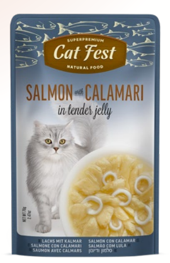
COMPOSITION: salmon 54%, salmon broth 38%, calamari 6%, yeast extract, fructo-oligosaccharides, anchovy fish oil, salt. ADDITIVES: Nutritional Additives: Vitamin E 800 mg/kg, Taurine 800 mg/kg