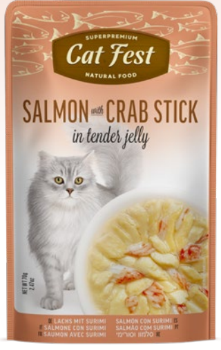
COMPOSITION: salmon 54%, salmon broth 38%, crab stick 6%, yeast extract, fructo-oligosaccharides, anchovy fish oil, salt. ADDITIVES: Nutritional Additives: Vitamin E 800 mg/kg, Taurine 800 mg/kg