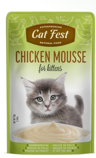
COMPOSITION: chicken 58%, chicken broth 39.9%, yeast extract, fructo-oligosaccharides, anchovy fish oil, salt. ADDITIVES: Nutritional Additives: Vitamin E 800 mg/kg, Taurine 800 mg/kg

Our kitten food boasts a tender and irresistible offering, infused with essential vitamins, minerals and amino acids to promote healthy growth and proper body and brain development. With a variety of flavors on offer, your young companion is sure to enjoy this wholesome option.