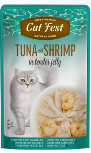
COMPOSITION: tuna 54%, tuna broth 40%, shrimp 4%, yeast extract, fructo-oligosaccharides, anchovy fish oil, salt. ADDITIVES: Nutritional Additives: Vitamin E 800 mg/kg, Taurine 800 mg/kg