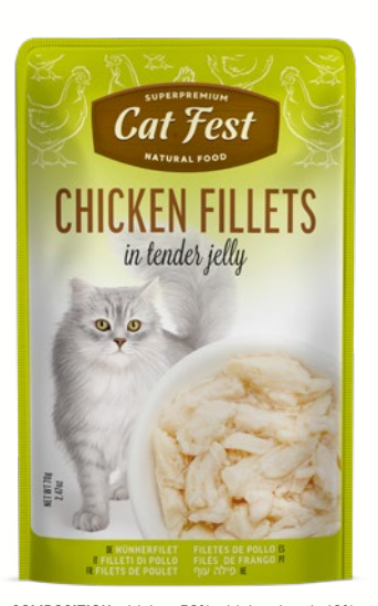
COMPOSITION: chicken 58%, chicken broth 40%, yeast extract, fructo-oligosaccharides, anchovy fish oil, salt. ADDITIVES: Nutritional Additives: Vitamin E 800 mg/kg, Taurine 800 mg/kg