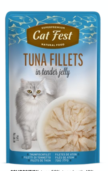
COMPOSITION: tuna 58%, tuna broth 40%, yeast extract, fructo-oligosaccharides, anchovy fish oil, salt. ADDITIVES: Nutritional Additives: Vitamin E 800 mg/kg, Taurine 800 mg/kg