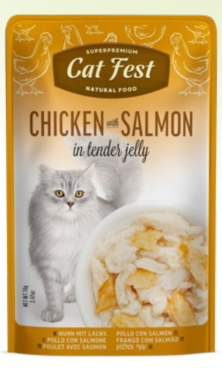
COMPOSITION: chicken 54%, chicken broth 38%, salmon 6%, yeast extract, fructo-oligosaccharides, anchovy fish oil, salt. ADDITIVES: Nutritional Additives: Vitamin E 800 mg/kg, Taurine 800 mg/kg