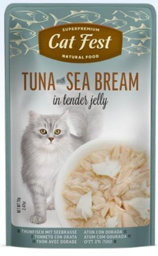
COMPOSITION: tuna 54%, tuna broth 38%, sea bream 6%, yeast extract, fructo-oligosaccharides, anchovy fish oil, salt. ADDITIVES: Nutritional Additives: Vitamin E 800 mg/kg, Taurine 800 mg/kg