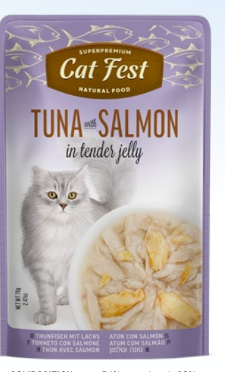
COMPOSITION: tuna 54%, tuna broth 38%, salmon 6%, yeast extract, fructo-oligosaccharides, anchovy fish oil, salt. ADDITIVES: Nutritional Additives: Vitamin E 800 mg/kg, Taurine 800 mg/kg