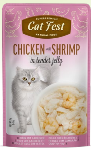
COMPOSITION: chicken 54%, chicken broth 38%, shrimp 4%, yeast extract. fructo-oligosaccharides, anchovy fish oil, salt. ADDITIVES: Nutritional Additives: Vitamin E 800 mg/kg, Taurine 800 mg/kg