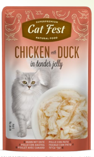
COMPOSITION: chicken 54%, chicken broth 40%, duck 6%, yeast extract, fructo-oligosaccharides, anchovy fish oil, salt. ADDITIVES: Nutritional Additives: Vitamin E 800 mg/kg, Taurine 800 mg/kg