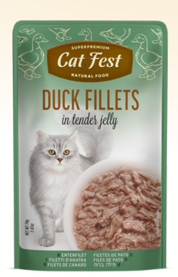
COMPOSITION: duck 58%, duck broth 40%, yeast extract, fructo-oligosaccharides, anchovy fish oil, salt. ADDITIVES: Nutritional Additives: Vitamin E 800 mg/kg, Taurine 800 mg/kg