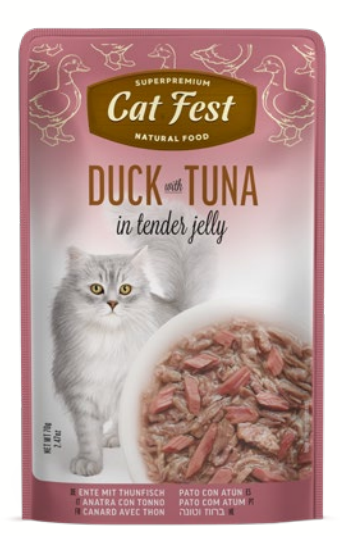
COMPOSITION: duck 54%, duck broth 38%, tuna 6%, yeast extract, fructo-oligosaccharides, anchovy fish oil, salt. ADDITIVES: Nutritional Additives: Vitamin E 800 mg/kg, Taurine 800 mg/kg