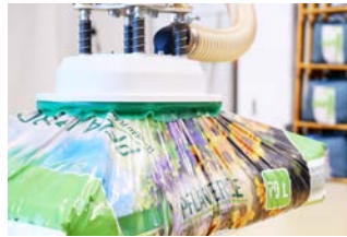
Use for automated handling on a robot or manual handling using a vacuum tube lifter