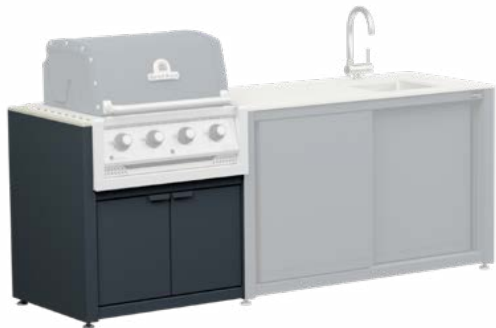
GRILL MODULE FOR BROIL KING