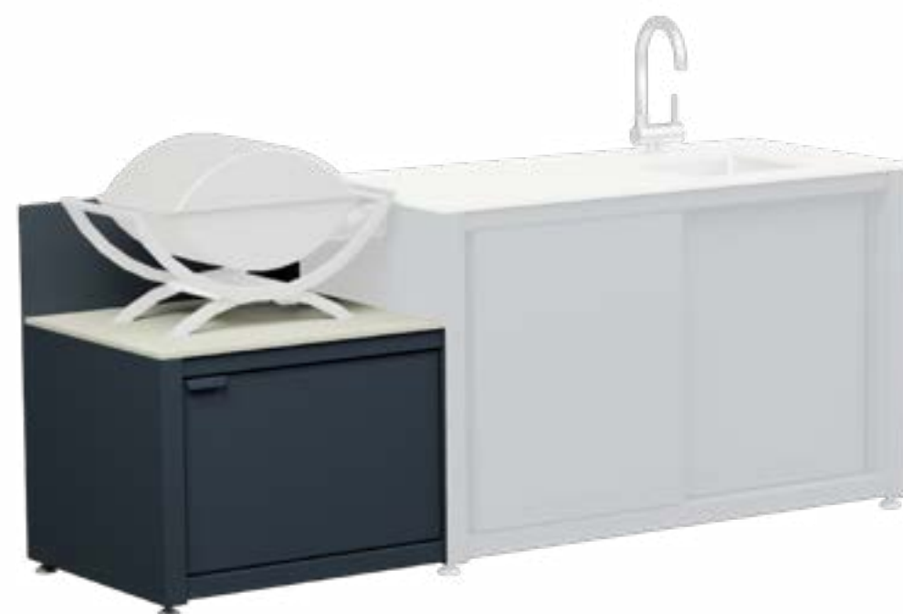
MINI GRILL MODULE