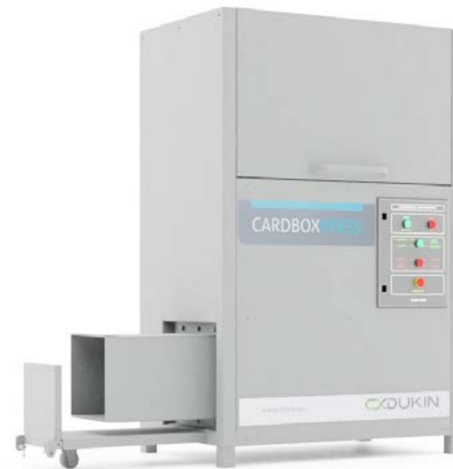
CardboxPRESS 200 with a lid

The CardboxPRESS 200 cardboard compactor is designed to reduce the volume of cardboard packaging for companies and medium-sized commercial buildings.