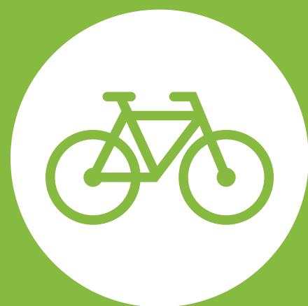
BICYCLE SHEDS/ STORAGE UNITS