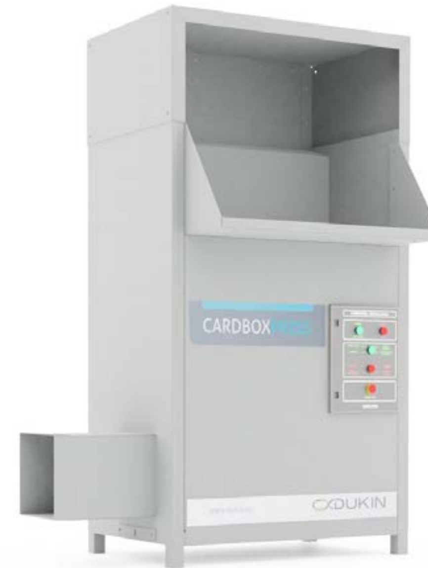
CardboxPRESS 200 with loading opening