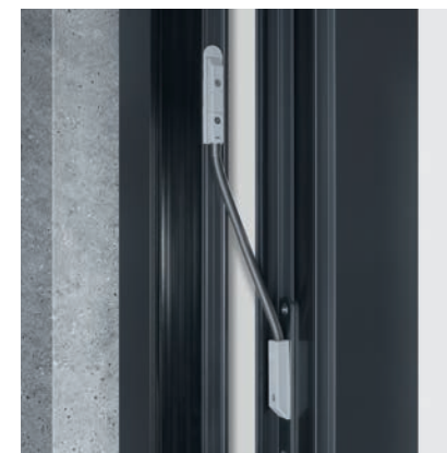
Separable cable transition