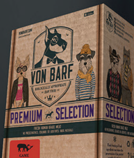
VON BARF PREMIUM SELECTION GAME

This is a complete meal of superior quality, easily digestible and extremely appetizing. In Chinese medicine, duck meat is considered a 'cool' meat that holistic veterinarians recommend for dogs with chronic inflammatory processes in the body, such as allergies and arthritis, as well as dogs with tumours. Duck can be the meat of choice for dogs allergic to chicken and beef.