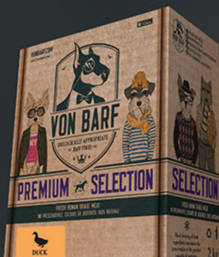
VON BARF PREMIUM SELECTION DUCK

ACCORDING TO THE LATEST MAJOR RESEARCH, PUPPIES THAT ATE AT LEAST 20% OF RAW FOOD WHILE GROWING UP, I.E., LESS THAN 80% OF INDUSTRIAL DRY FOOD, HAD A SIGNIFICANTLY LOWER RISK OF OCCURRENCE OF ALLERGIES AND ATOPIC DERMATITIS LATER IN LIFE.