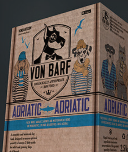
VON BARF ADRIATIC

VON BARF SENSITIVE is an ideal choice for dogs with a sensitive digestive system, as well as allergy-prone dogs. Due to its specific smell, dogs find it irresistible! The secret of this meal is the indescribably healthy, useful and green beef tripe, which is an excellent source of easily digestible proteins for dogs, as well as enzymes, minerals, vitamins and fatty acids. It also contains the probiotic Lactobacillus acidophilus .