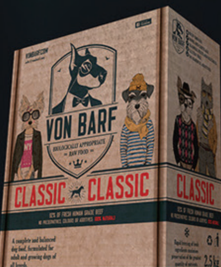
VON BARF CLASSIC

VON BARF CLASSIC is our best-selling product, a favourite among different breeds, from the smallest to the largest ones. It is a delicious, complete meal, which contains more than 90% beef, with the addition of fresh vegetables and fruits and a small amount of garlic, which has multiple benefits for dogs, the same as for humans.