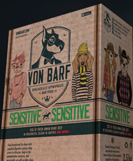
VON BARF SENSITIVE

IT IS NEVER TOO EARLY OR TOO LATE TO SWITCH TO RAW FOOD! BOTH PUPPIES AND SENIORS WILL BENEFIT GREATLY FROM NATURAL NUTRITION.