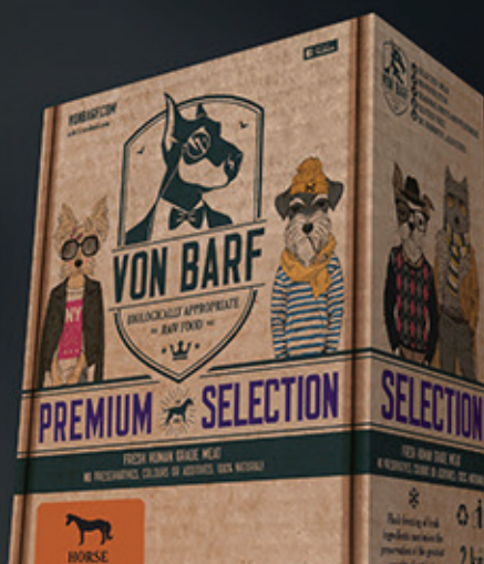
VON BARF PREMIUM SELECTION HORSE

Rabbit meat is widely known for its outstanding dietary properties. This superior white meat is rich in easily digestible proteins and low in fat. This is why it is recommended in the diet of dogs with a sensitive digestive system, allergy-prone dogs, as well as overweight dogs and the ones that must watch their fat intake for other health reasons.