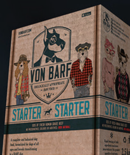
VON BARF STARTER

VON BARF CLASSIC is our best-selling product, a favourite among different breeds, from the smallest to the largest ones. It is a delicious, complete meal, which contains more than 90% beef, with the addition of fresh vegetables and fruits and a small amount of garlic, which has multiple benefits for dogs, the same as for humans.