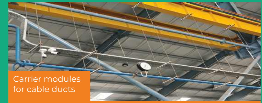
Carrier modules for cable ducts