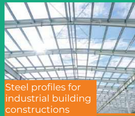
Steel profiles for industrial building constructions