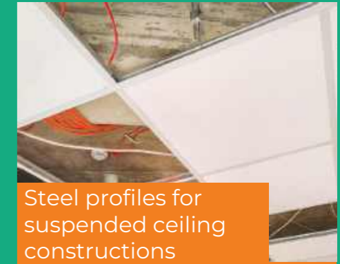
Steel profiles for suspended ceiling constructions