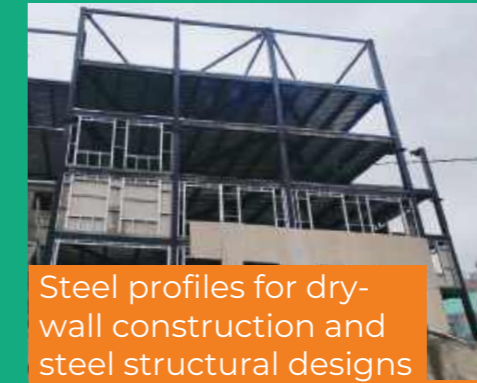
Steel profiles for dry-wall construction and steel structural designs