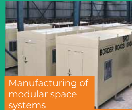
Manufacturing of modular space systems