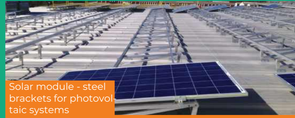
Solar module - steel brackets for photovoltaic systems