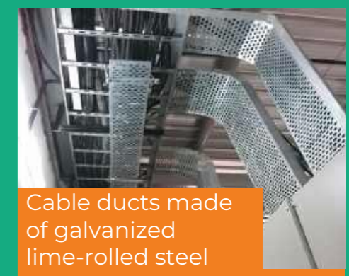
Cable ducts made of galvanized lime-rolled steel