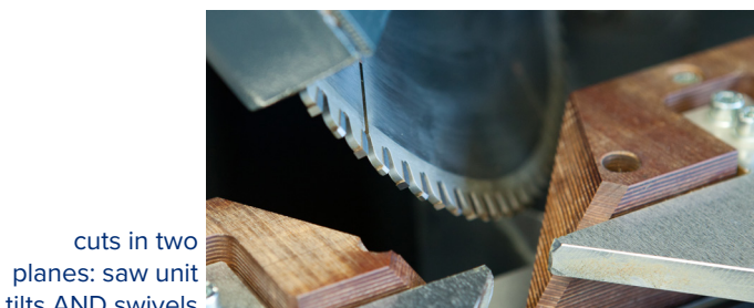
cuts in two planes: saw unit tilts AND swivels