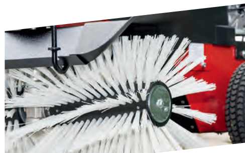
40 CM BRUSH DIAMETER