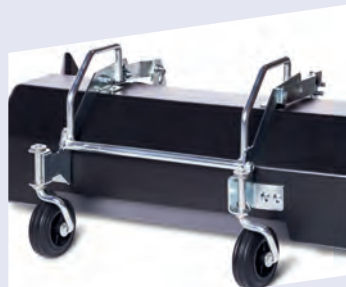
PLASTIC SWEEPINGS COLLECTOR

Your satisfaction is important to us. Consequently, we offer an extensive range of accessories that facilitate work in any season and in any weather