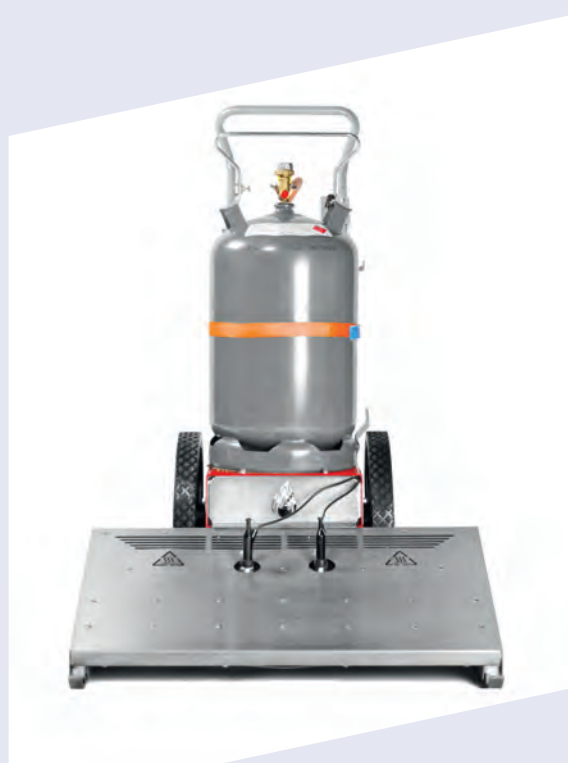
SPECIAL THERMAL INSULATION