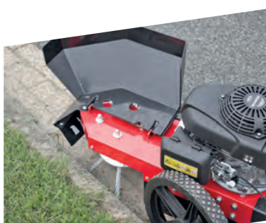
LATERALLY PIVOTING BRUSH For convenient work on edges.