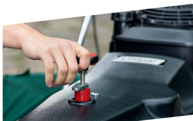
CENTRAL BRUSH HEIGHT ADJUSTMENT