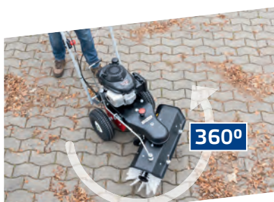
360° FREEWHEEL DRIVE