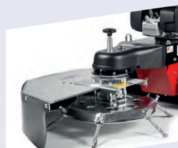
ATTACHMENT WEED BRUSH