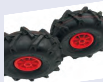
AGRICULTURAL TREAD PROFILED WHEELS