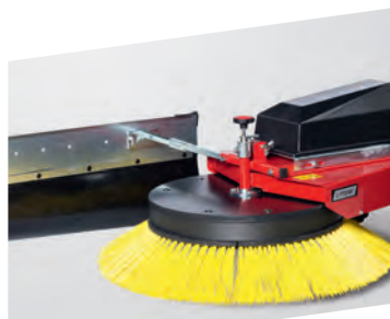
RADIAL WITH SWATH FORMER