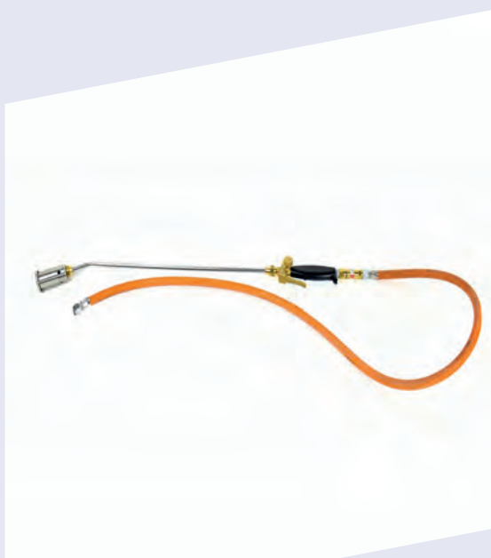
ACCESSORIES : HAND BURNER