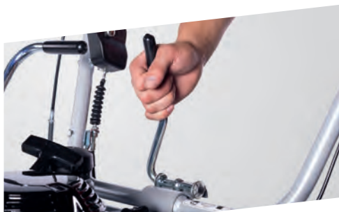
CENTRAL HANDLEBAR HEIGHT ADJUSTMENT