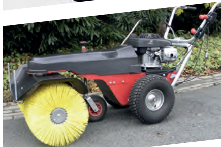
Optional: disk brushes