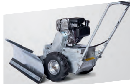
FEED PUSHING BLADE