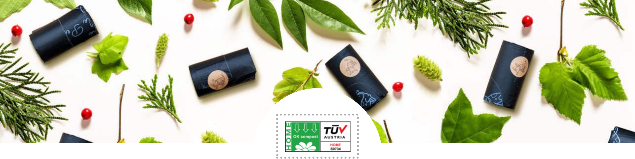
100 % biodegradable