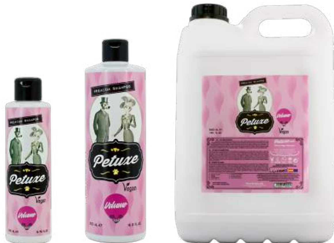
00226 · 200 ml