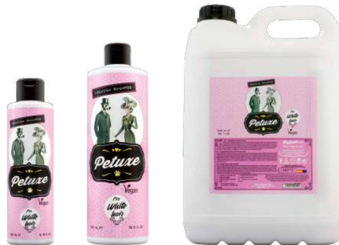
00220 · 200 ml