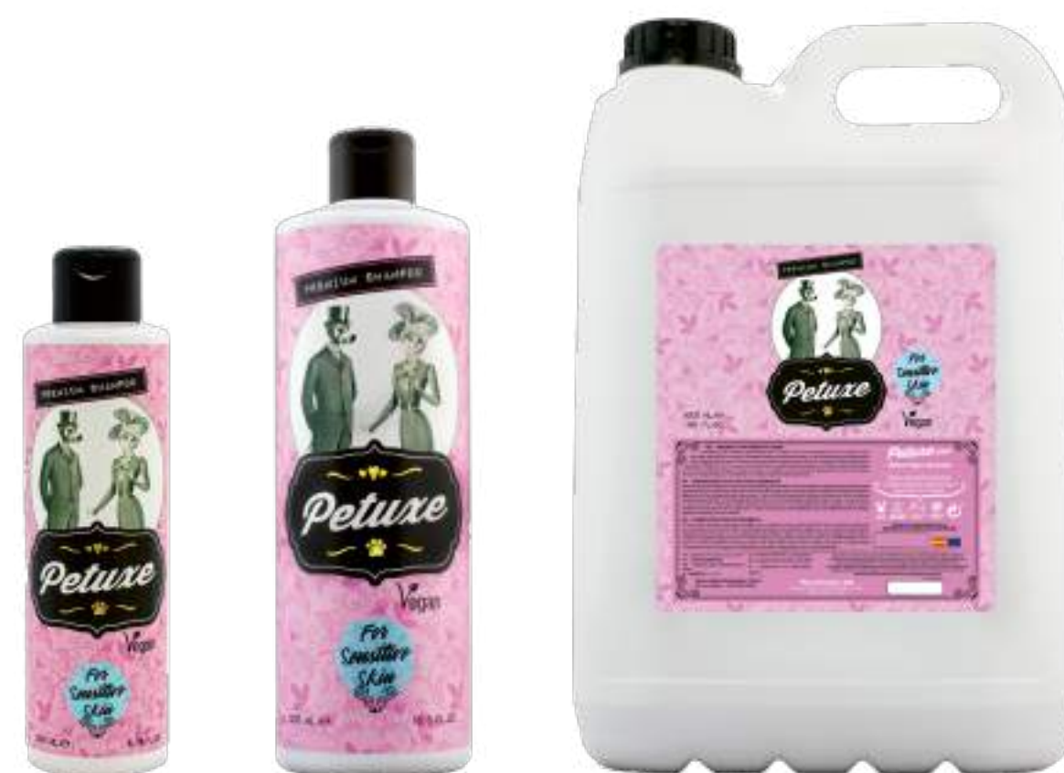
00225 · 200 ml