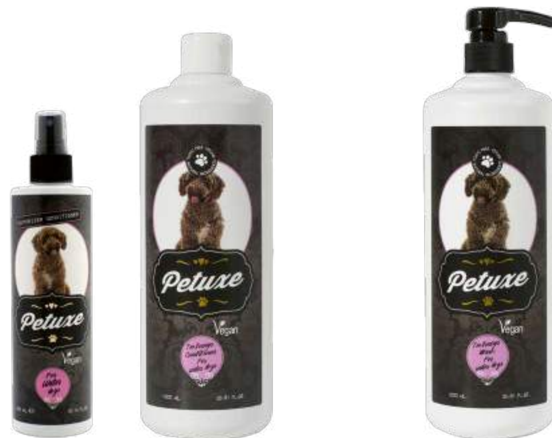
00264 · 200 ml