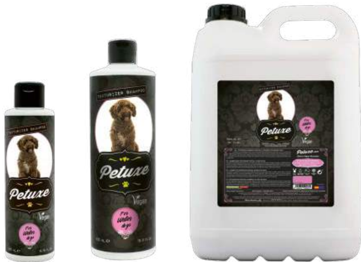
00227 · 200 ml