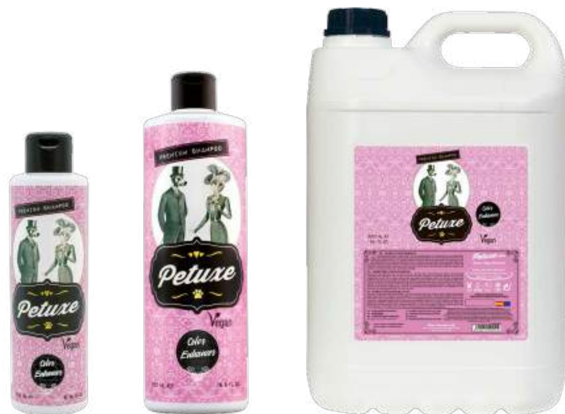
00222 · 200 ml