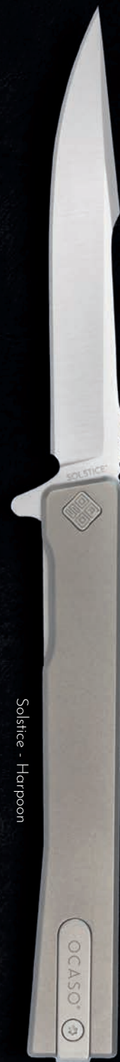
Solstice - Harpoon