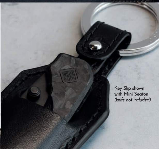
Key Slip shown with Mini Seaton (knife not included)