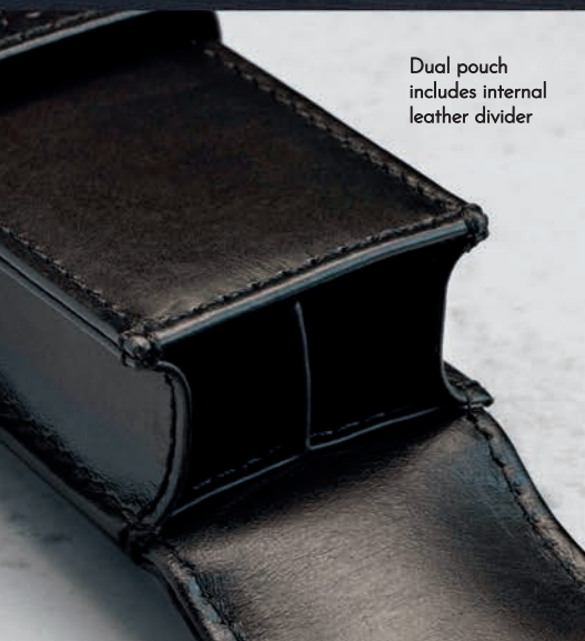
Dual pouch includes internal leather divider