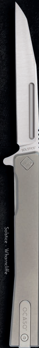
Solstice - Wharncliffe