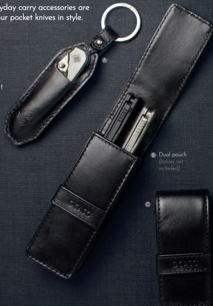
B Dual pouch (knives not included)

Closed Dimensions (Single): 4-¼" L x 1-½" W (Dual): 4-¾" L x 1-½" W