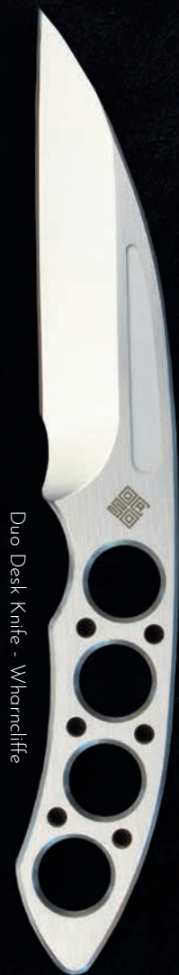
Duo Desk Knife - Wharncliffe