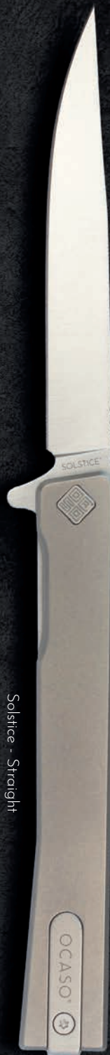
Solstice - Straight