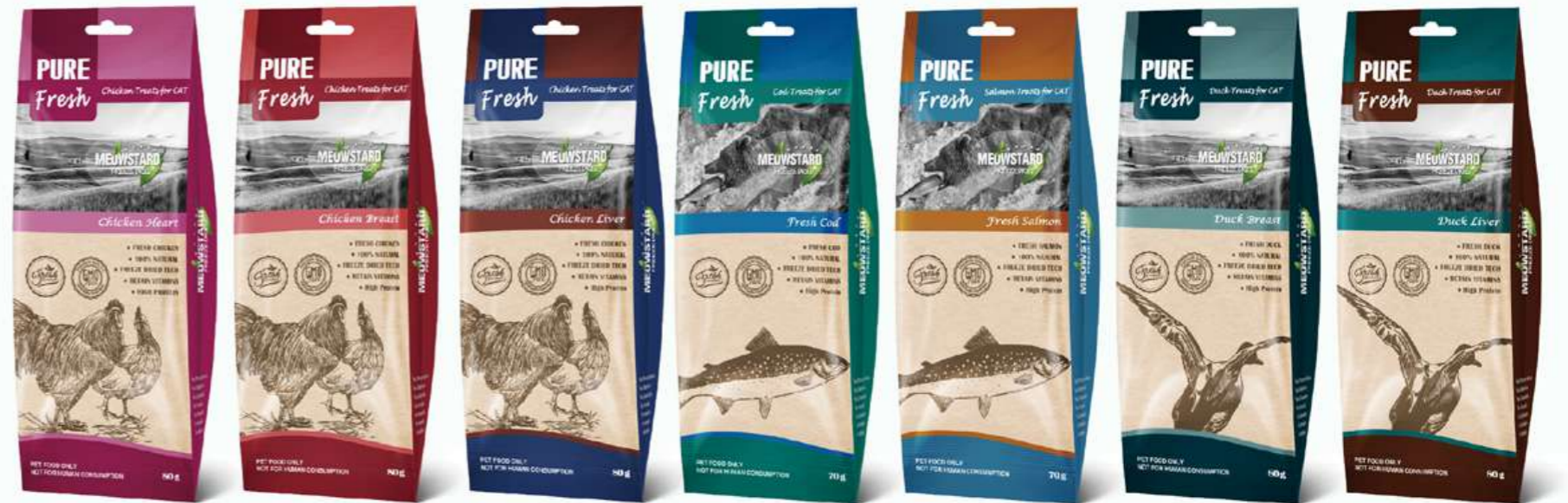
Chicken Heart Chicken Breast Chicken Liver Fresh cod Fresh Salmon Duck Breast Duck Liver