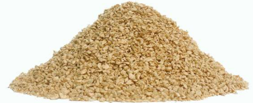
fir cat litter