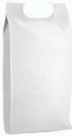
4-seal with plastic handle