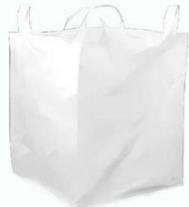
ton sack with handles for forklifts