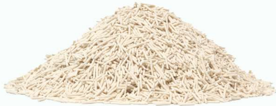
tofu cat litter

Can provide customized formulas for various cat litters & deodorizing ingredients