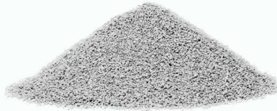
sodium bentonite cat litter