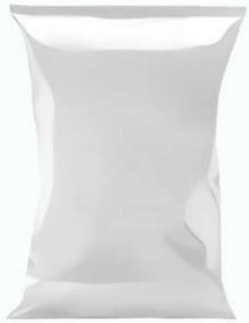
3-seal without handle