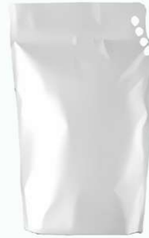
pocket with side handle