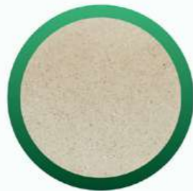
Composite Biological Enzymes