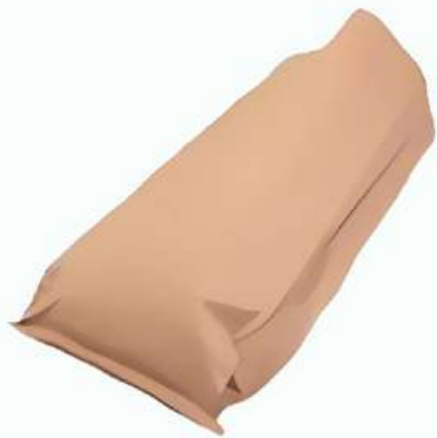
kraft paper sack