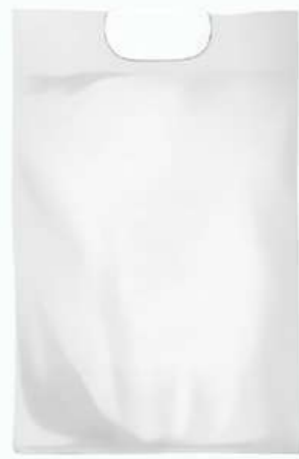
3-seal with plastic handle