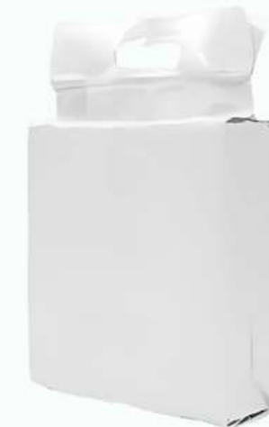
vacuum plastic bags