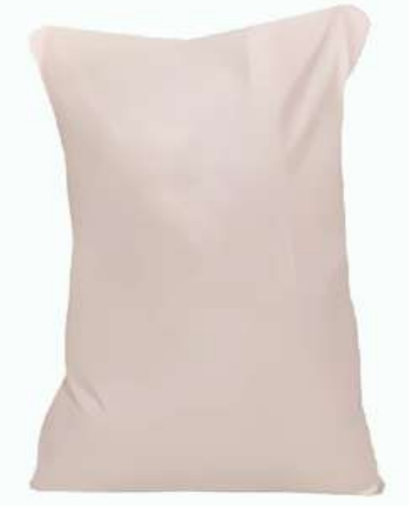
white plain woven sack