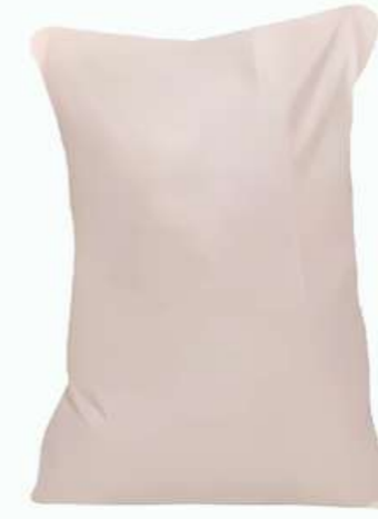
color print woven sack