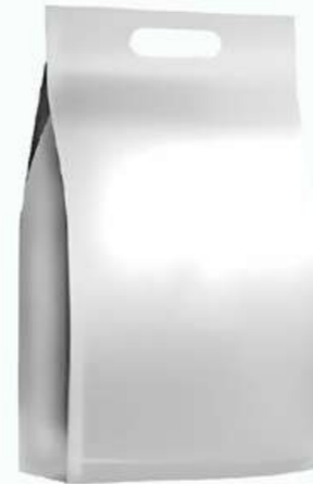
8 side sealed plastic bags