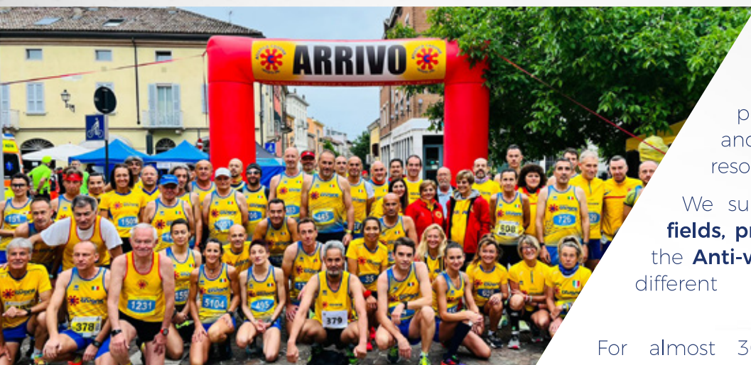
Casone Running team