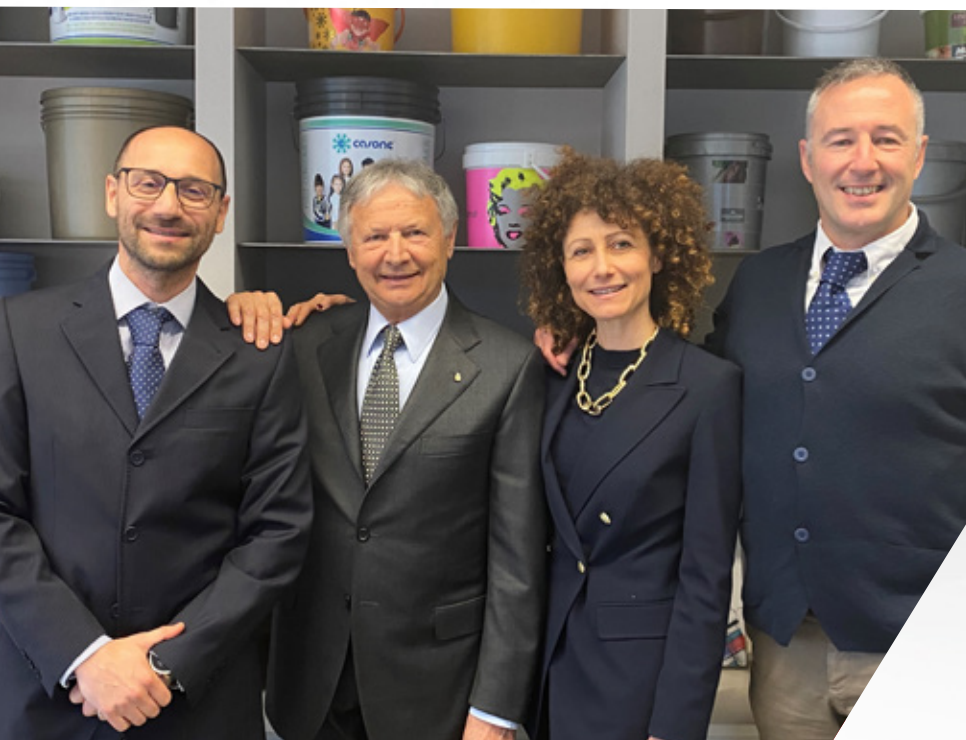
Casone S.p.A. Board of Directors