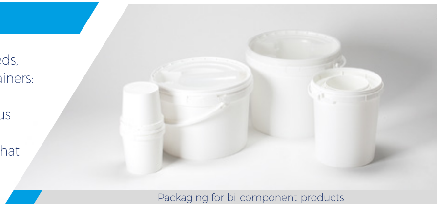
Packaging for bi-component products