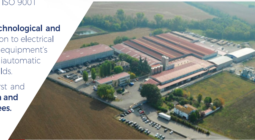
Factory Aerial Photo