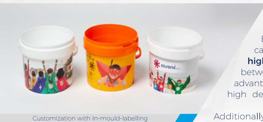
Customization with In-mould-labelling