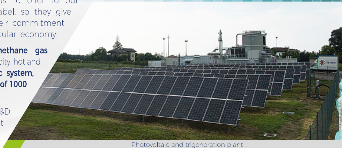
Photovoltaic and trigeneration plant