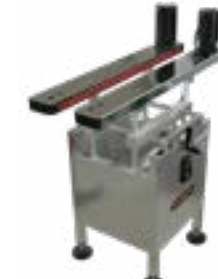
BOTTOMLESS SIDE BELT Conveyor