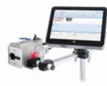
VIPER TII Thermal Printing System