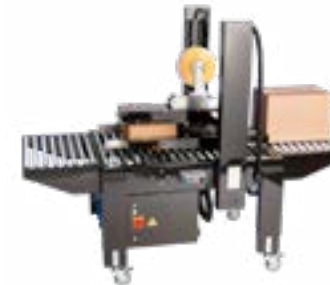
SB-2EX RANDOM Random Side Belt Case Taper