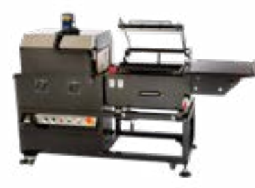
COMBO UNIT Value Series