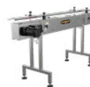
STAINLESS STEEL INLINE Conveyor