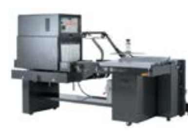
COMBO UNIT Professional Series