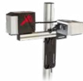
COPILLOT MAX512i Hi-Res Printing System