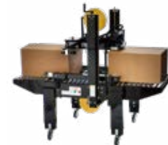
SB/TB-2 Side Belt & Top Belt Case Taper