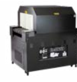
SHRINK TUNNEL Performance Series