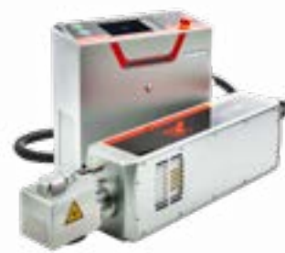
SQ-30 CO 2 Laser Coding System