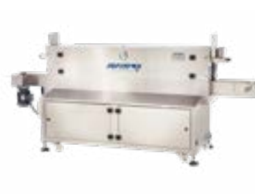
WSN GEN-S All-in-One Steam Heat Shrink Tunnel