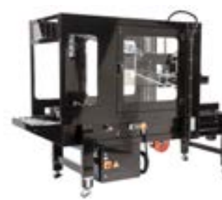
SB-2EX AUTO Side Belt Auto Case Taper