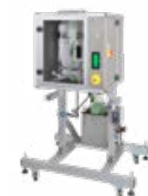
CH-100 Tamper Evident Band Applicator