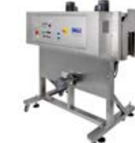
ES-200 Electric Heat Shrink Tunnel