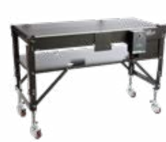
EASTEY CONVEYOR Variable Speed