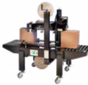
TB-2 Top Belt & Bottom Belt Case Taper