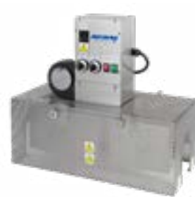
GS SERIES Radiant Heat Shrink Tunnel