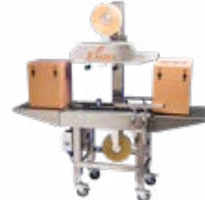
BB-2 SS Stainless Steel Bottom Belt Taper