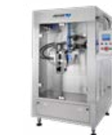
LX-350 Shrink Sleeve Label Applicator