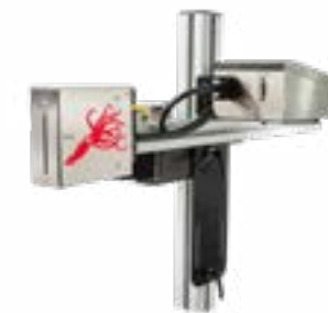
COPILLOT 500 Hi-Res Printing System