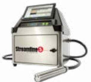
STREAMLINE 5 CIJ Small Character Coder