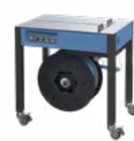
EXS-100 Semi-Auto Strapping