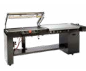
L-SEALER Pneumatic Professional Series