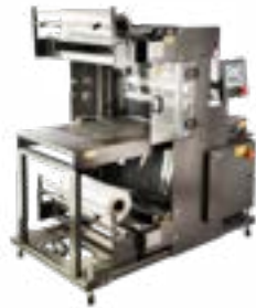
AUTO BUNDLER Professional Series EB25A