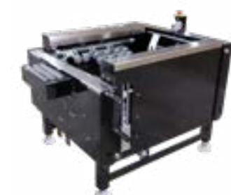
EX-CF Semi-Automatic Carton Former