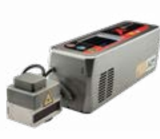
SQ-10 CO 2 Laser Coding System