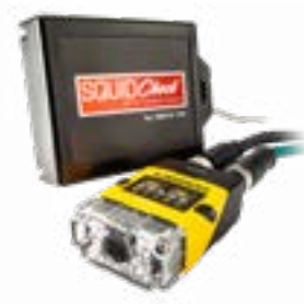
SQUIDCHECK Print Validation System