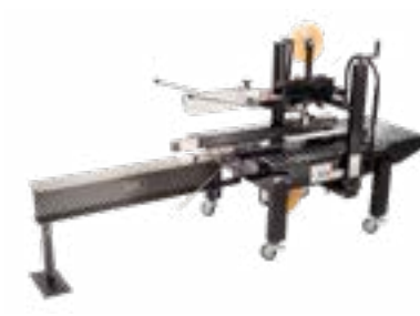
EASY PACKER Side Belt Case Taping System