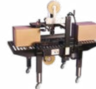
SB-2EX Side Belt Case Taper