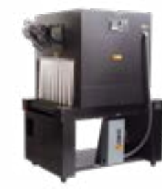
BUNDLING TUNNEL Performance Series