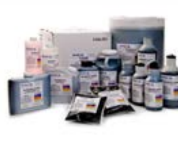
INKJET FLUIDS Hi-Res, DOD, CIJ Make-up Fluids