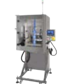
LX-150 Shrink Sleeve Label Applicator