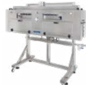
WSN SERIES Steam Heat Shrink Tunnel