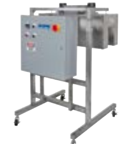
OAL CLASSIC Radiant Heat Shrink Tunnel