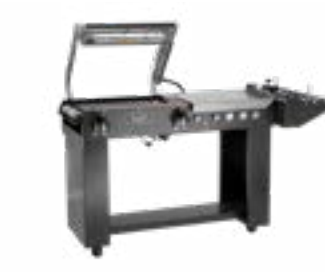
L-SEALER Performance Series