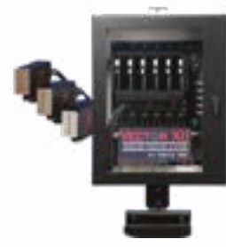
VECTOR XII DOD Printing System