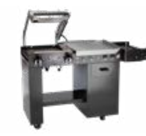
L-SEALER Professional Series