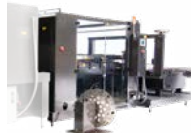
AUTO L-SEALER Professional Series