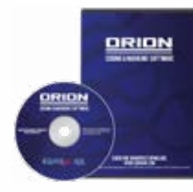
ORION Coding & Marking Software