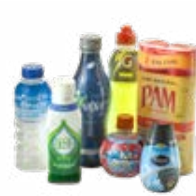
SHRINK LABELS Shrink Sleeve Labels