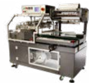
AUTO L-SEALER Value Series VSA1721