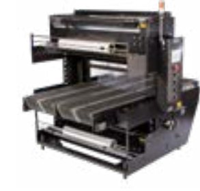
AUTO BUNDLER Professional Series EB35A, 50, 70