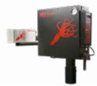
SQ/2 SCORPION DOD Printing System