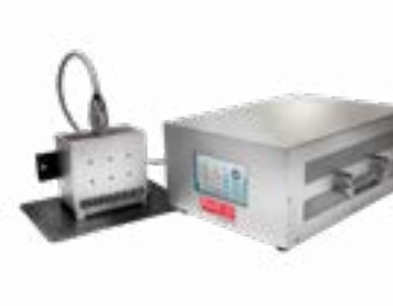
SQUID UV UV LED Curing System