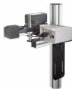
COPILLOT 256 Hi-Res Printing System