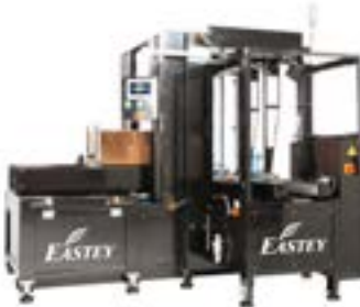
ERX-15 Automatic Case Erector