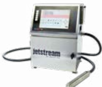
JETSTREAM CIJ Small Character Coder