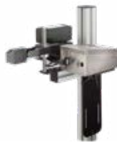
COPILLOT 128 Hi-Res Printing System