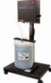
TITAN Ink Delivery System