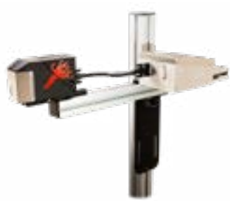
COPILLOT Hi-Res Printing System