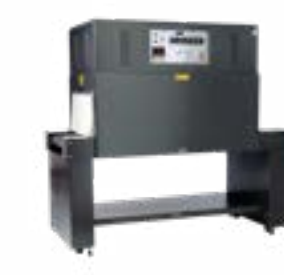
SHRINK TUNNEL Professional Series