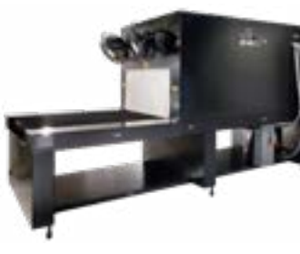
BUNDLING TUNNEL Professional Series