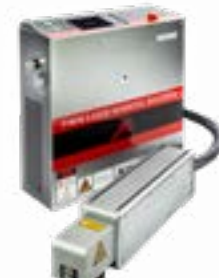
SQ-50F Fiber Laser Coding System