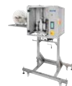
LX-100 Shrink Sleeve Label Applicator