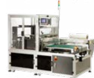
AUTO L-SEALER Value Series VSA2530