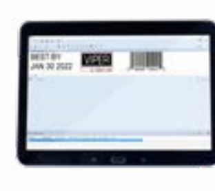
SIRIUS Coding & Marking Software