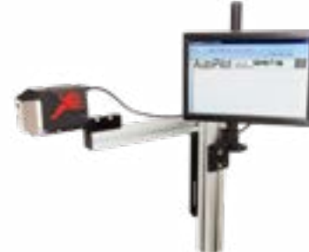
AUTOPILOT Hi-Res Printing System