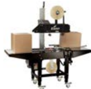
BB-2 Bottom Belt Case Taper