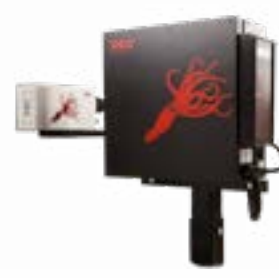
SQ/2 DOD Printing System