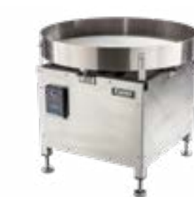
ACCUMULATION Accumulation Tables