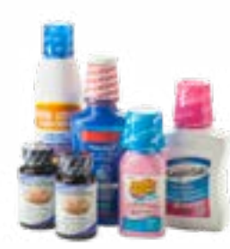
SHRINK BANDS Tamper Evident Shrink Bands