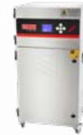
SQ-LFX Laser Fume Extraction