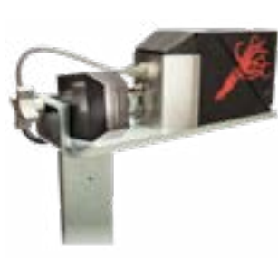
COPILLOT FLEX Hi-Res Printing System