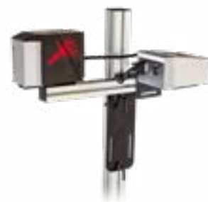
COPILLOT MAX Hi-Res Printing System