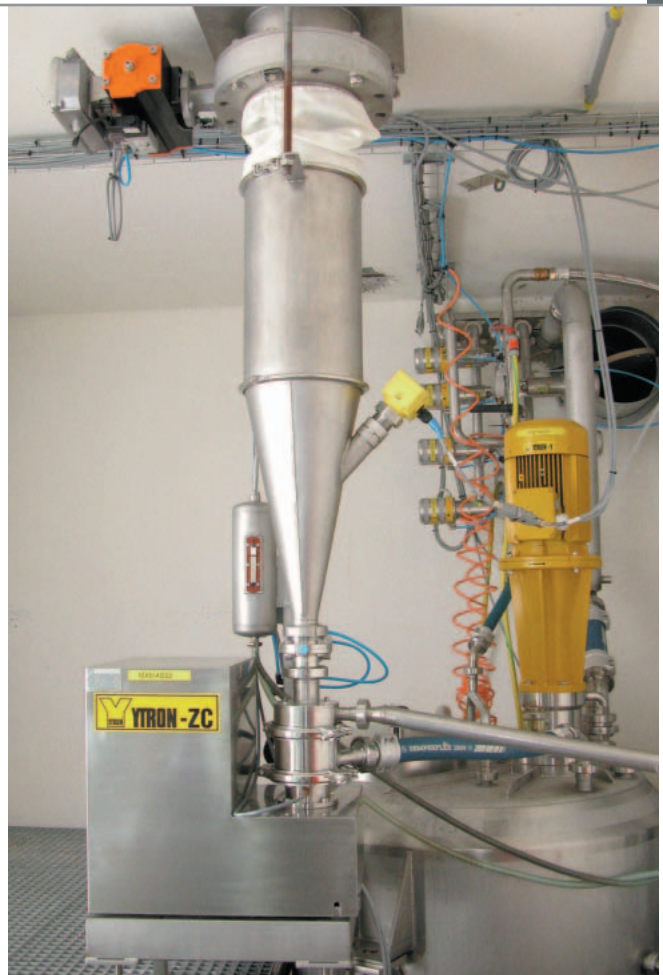
YTRON-ZC with powder addition via silo Application: Suspending of Spices