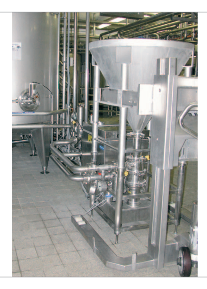
YTRON-ZC in the Dairy Industry Application: Dispersing of a Protein Hydrolysate