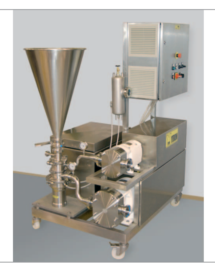
YTRON-ZC ViscoTron for high viscosities and /or high solids ratio