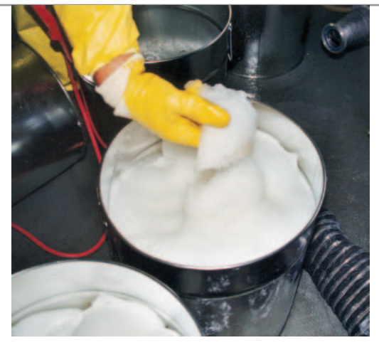
Product example: Carbopol -Concentration approx. 12%