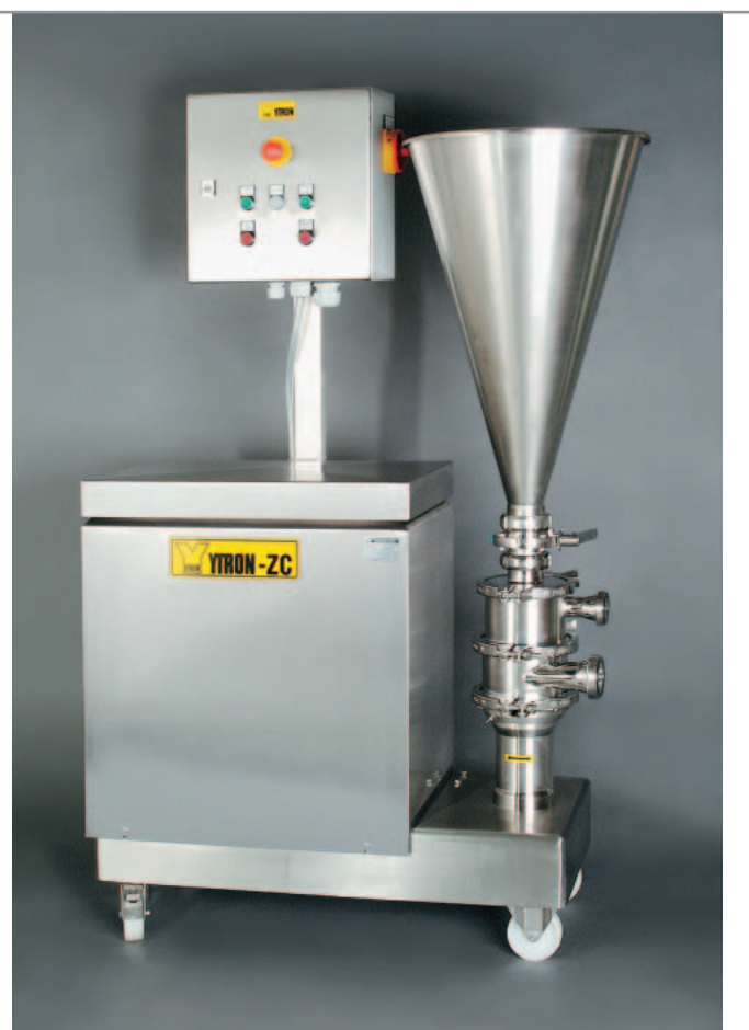
YTRON-ZC 3 with switchboard and powder hopper for manual powder addition