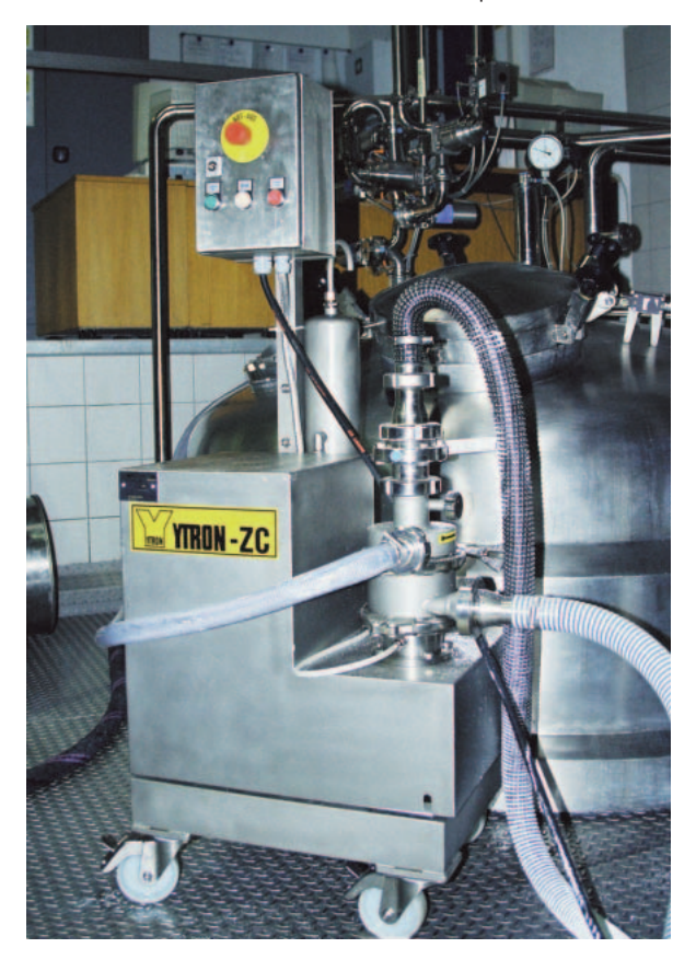
YTRON -ZC Application: Dispersing of Acrylic Acid Polymers for Shampoo Production

Due to the adjustable powder/liquid ratios, concentrations ranging from 0.5 - 10 % can be achieved.