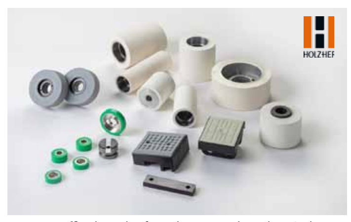
We are an official supplier for Holz-Her Maschinenbau GmbH.