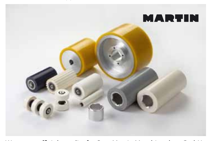
We are an official supplier for Otto Martin Maschinenbau GmbH.