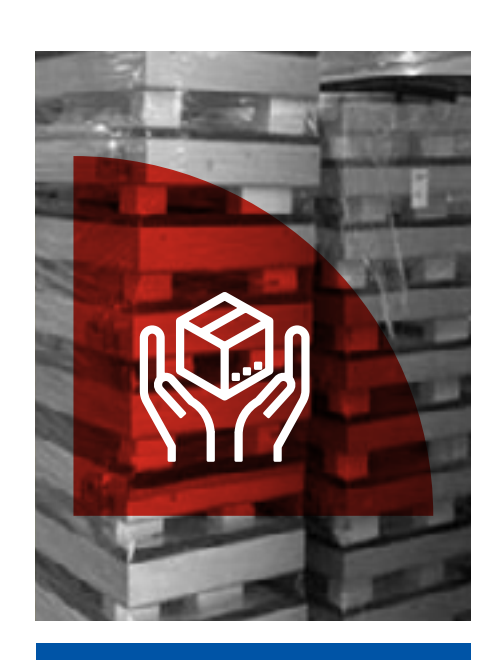
Production & Packaging