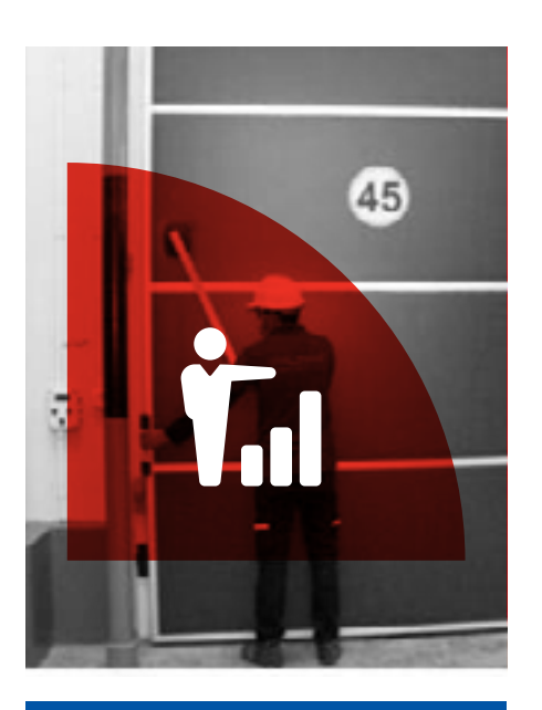
After Sales Service