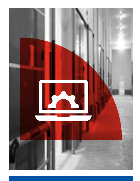
Installation & Preview Site