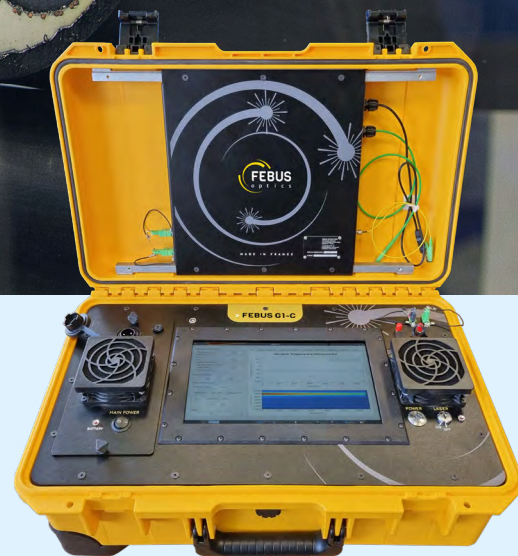
> Portable and autonomous version of the G1 series (FEBUS G1-C)