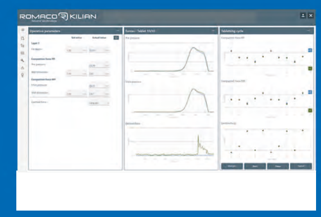
Powder analysis / production optimization