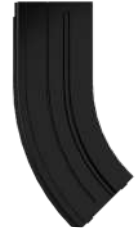
30 ROUNDS 7,62mm x 39 AR TYPE MAGAZINE