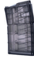
20 ROUNDS 7,62mm x 51 NATO MAGAZINE