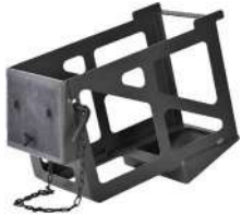
AMMUNITION BOX TRAY