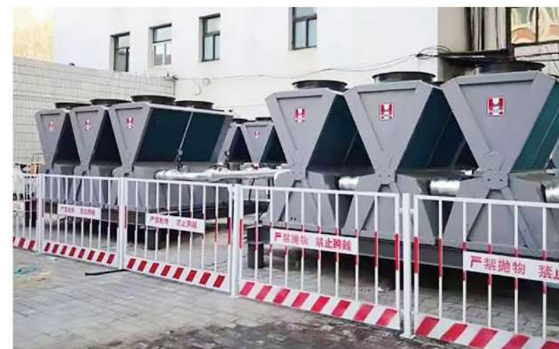
医院净化空调应用 A/C for hospital