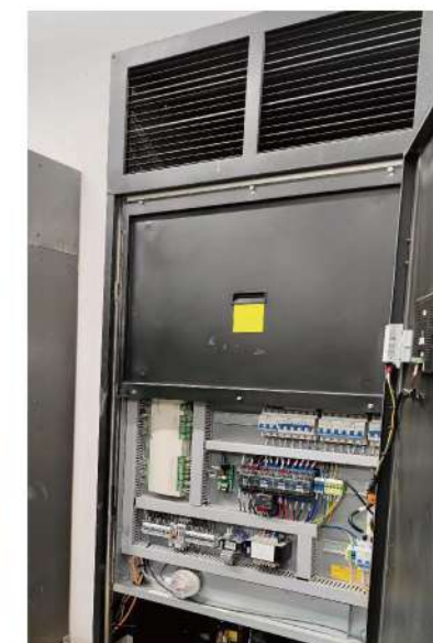
机房空调应用 Machine room air conditioner