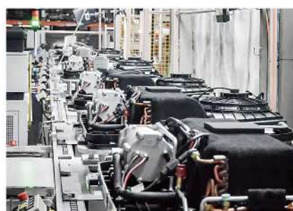
顶装式驻车空调 Parking cooler