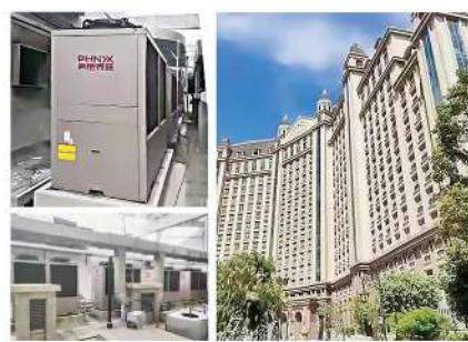
酒店热水应用 Hot water heat pump