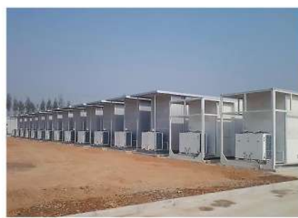
烟草烘干应用 Tobacco leaves drying