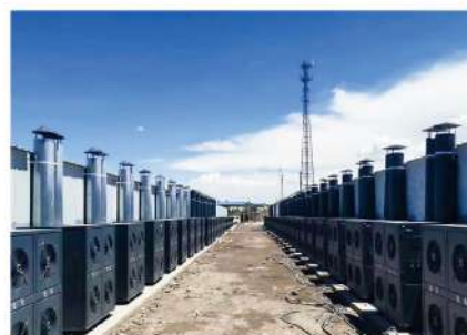
杏脯烘干应用 Apricot drying