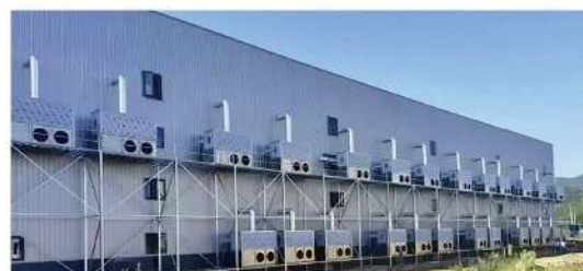
蘑菇库种植应用 for mushroom bank planting