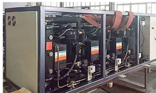
超市冷柜配套机组应用 for refrigerated shelves

Scroll compressor for mid. and low temp. application: fixed speed 2-25hp / DC inverter 38-72cc