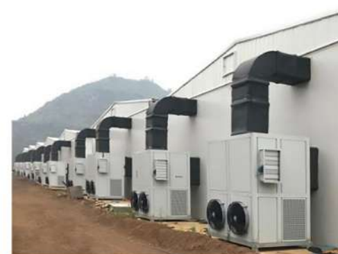
花卉养殖应用 for greenhouse