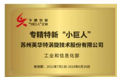
国家专精特新“小巨人”企业