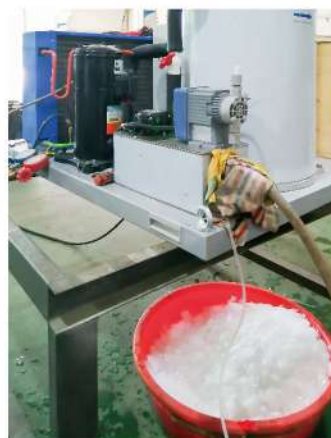
制冰机应用 for ice machine