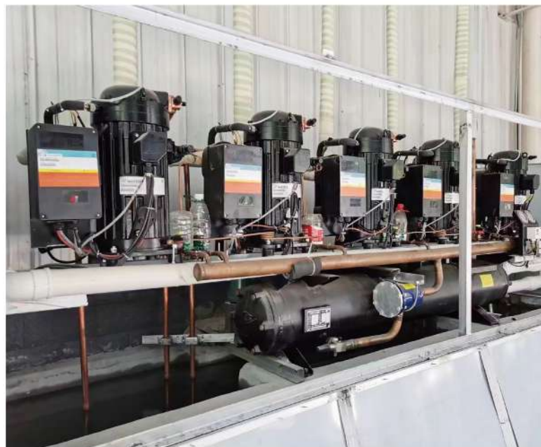
低温冷库应用 for low temperature cold store