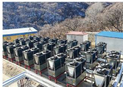
北方采暖应用 Residential heating