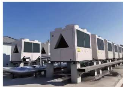
忻州采暖项目 Xinzhou Heating Project

Scroll compressor for heat pump application: fixed speed 2-25hp / DC inverter 38-130cc