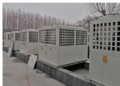
禽类养殖应用 Heating for henhouse