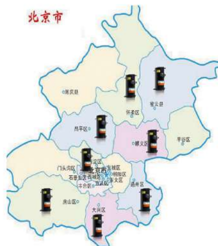
北京市 北京煤改电 Beijing "Coal to Electricity" application