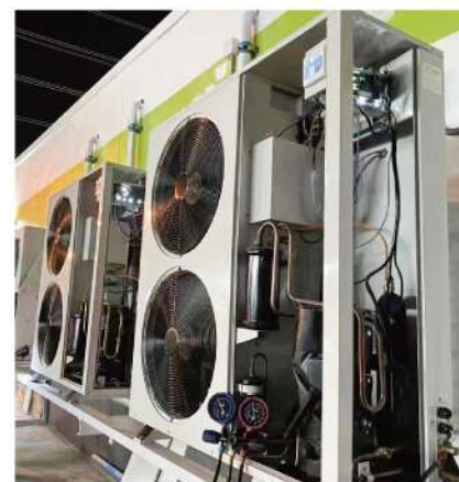
便利店冷柜中变频中温机应用 for medium-temperature cold storage