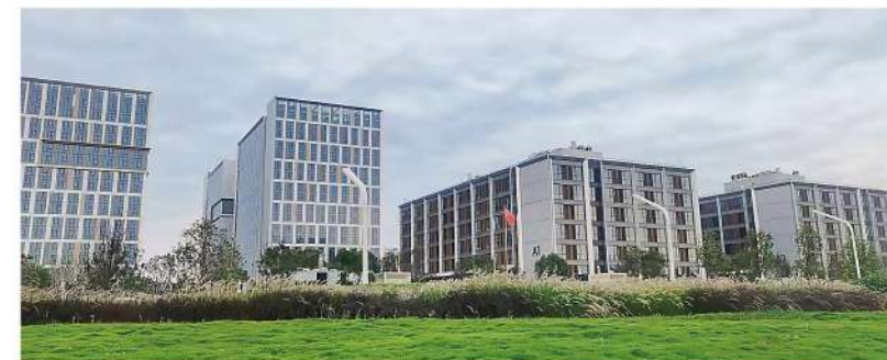
酒店空调系统应用 Hotel air conditioning system