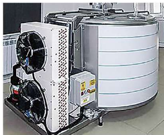
奶罐应用 for milk tank