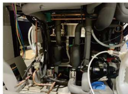
环境试验仪器应用 for environmental test instrument