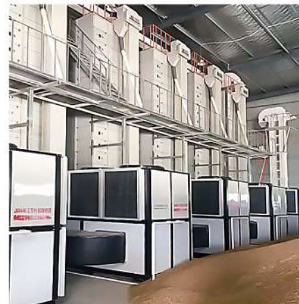
粮食烘干应用 Grain drying