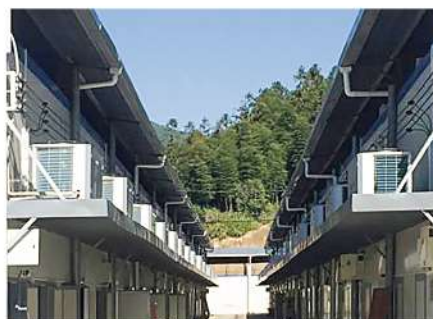
银耳养殖应用 for agriculture planting