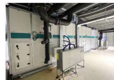
车间净化空调应用 Workshop purification air conditioner