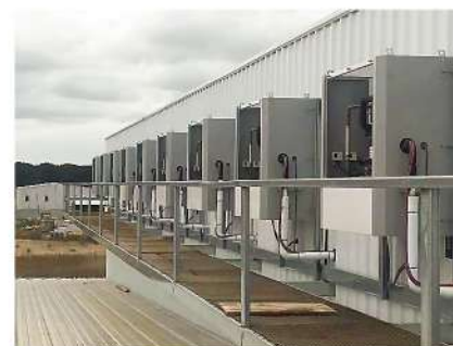
中温冷库应用 for medium-temperature cold storage