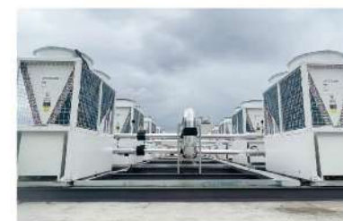
新能源车厂风冷模块机应用 Air conditioning of new energy vehicle factory