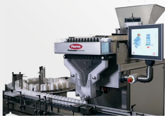
Linear counting systems