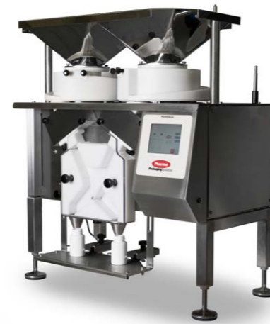
Semi-automatic counting systems