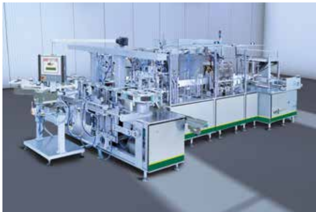
Bag-on-valve pouch-packaging machines for industrial packaging.

Whatever product you are looking to pack efficiently – SN technology will work for you.