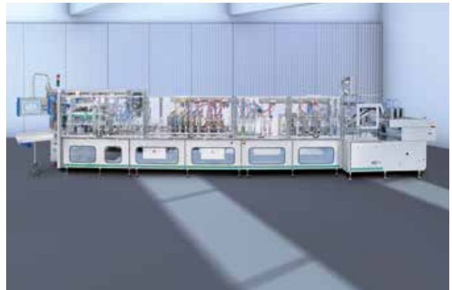
FM 200: Also for pet food pouches in all standard formats.

The FS and FFS machines from SN are characterized by their great flexibility in formats. All dosing systems which are typically used in this field of industry can be combined and all of the established pouch formats can be run on the machines. The integration of resealing-systems (zipper, slider or velcro) is easily possible.