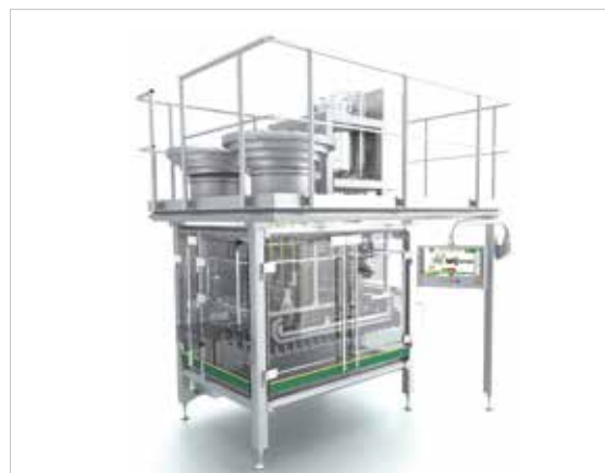
SF 400 for all spouts and all shape variants.

On the new machine SF 400 the beverage is filled into a pre-made pouch through the spout. This is a clean, quick and precise process. Smooth surfaces and the separation of all areas which are hygienically relevant make it very easy to keep the machine perfectly clean. All international hygiene standards can be met.