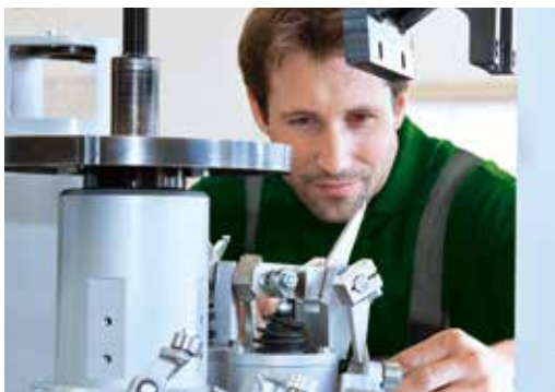
Production, reliability and an extraordinary long live cycle are standard at SN.