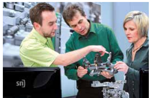
Development and construction. SN turns the conceivable into the doable.