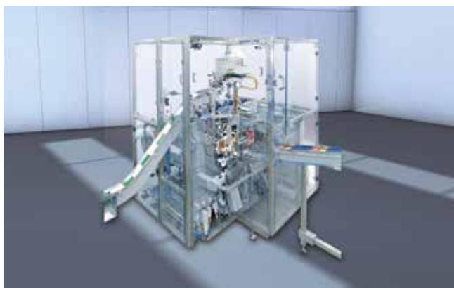
FBV-MK: Configure seed pouches individually.

All dosing devices are developed further in a continuous manner with the focus on maximum precision and most gentle handling of the single grain. All dosing aggregates are available as mobile units and can be utilized either as stand-alone component or as exchangeable dosing device on various machines. All FM machines can be equipped with any of the advanced SN dosing devices.