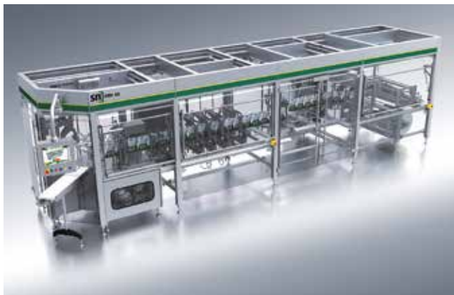
FMH 80 in hygienic design for dry and wet food in all possible variations.

Any type of dry or wet food – also in combination – can be filled with the new FMH 80. The machine is compatible with all classic and special dosing systems. Partly automated format change overs help reduce change over times considerably and enhance repeat accuracy. The machine is capable of producing 50 - 600 pouches per minute.