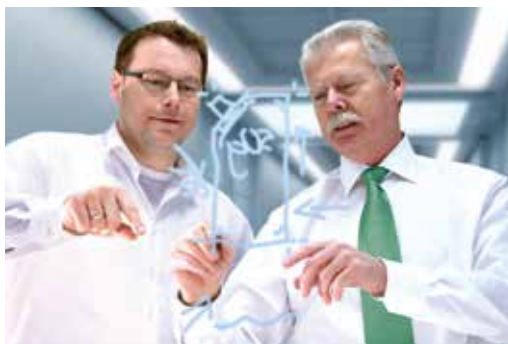
Consulting. At SN the solution starts with listening.

What characterizes the SN team are the same qualities that have made the term "Made in Germany" a global signifier of quality: innovation, hard work, precision, reliability and a high level of commitment. SN follows the "short distance" principle and believes in flat hierarchies. Responsible teams involved in development, construction, production, sales and service work hand in hand, thus guaranteeing personalized customer service, a smooth workflow, short delivery times and a high "return on investment".