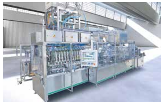
LMS 124: ULTRA-CLEAN for all cold and hot fillings.