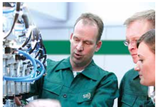
Service. As reliable as the SN technology.