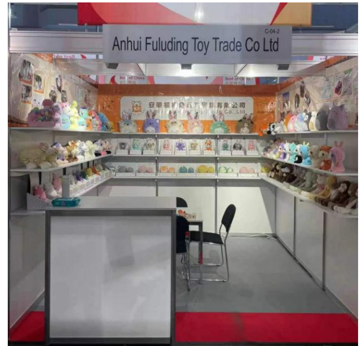
Spielwarenmesse Fair in January (Germany)