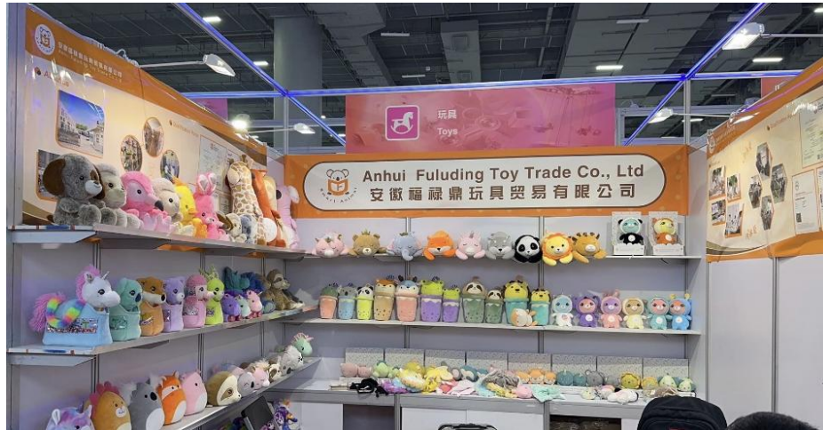
Canton Fair in October (Guang Zhou)