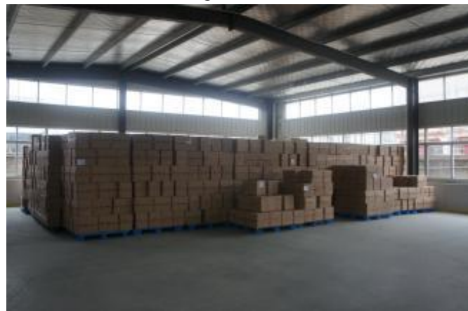
Finished Goods Warehouse