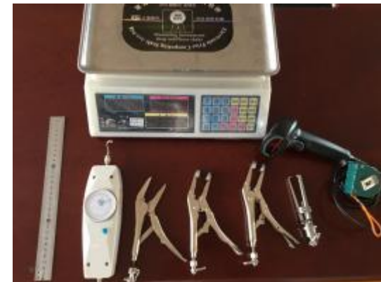
Pull test machine