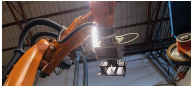
AUTOMATIC DEBURRING AND MACHININGS