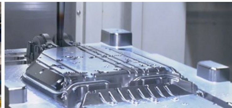
MOULD AND TRIMMING TOOL CONSTRUCTION

WE FOLLOW THE WHOLE PRODUCTION PROCESS, PROVIDING THE FINISHED PRODUCT READY TO BE ASSEMBLED