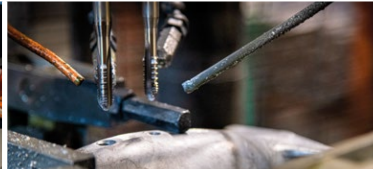
CNC MACHINING AND SANDBLASTING