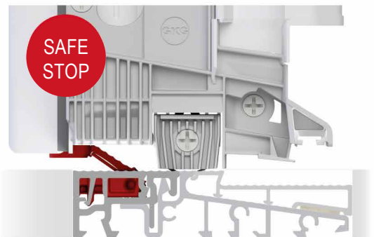
Self-releasing door stop for French doors