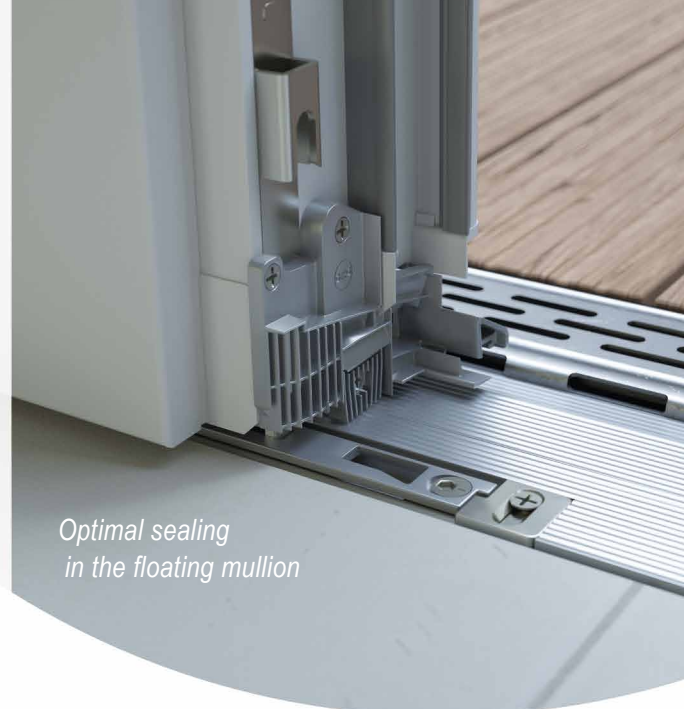
Optimal sealing in the floating mullion

Particular ease of use for floor-level French doors (without middle post) is given by the new closing aid SAFE STOP with its self-releasing door stop.