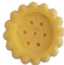
TARTLET ø 4,5 cm