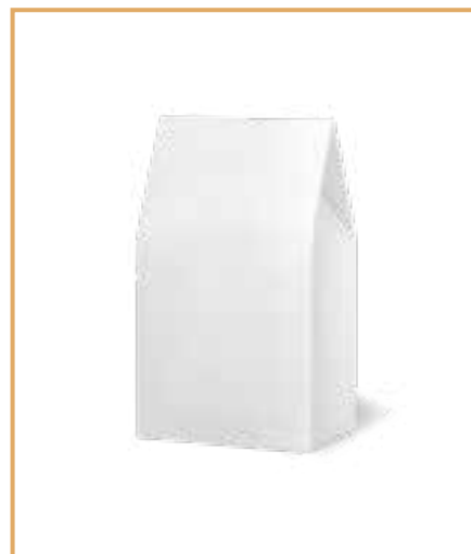
Plus box (available with front window) from 200g to 800g