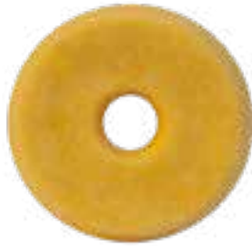
WHEEL ø 4,5 cm