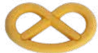
BRETZEL cm 6,5x4