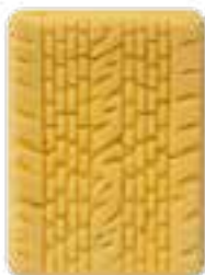
COOKIE cm 5x7