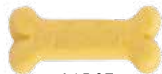
LARGE cm 2x7,5