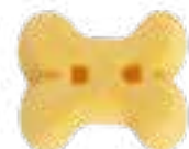
SMALL cm 1,75x2,15