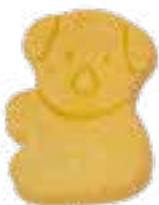
ANIMALS cm 2,5x3,5