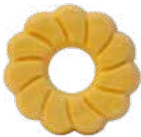
FLOWER ø 4,5 cm

We have created 11 cylinders for the production of our biscuits. We can design other cylinders with specific shapes required by our customers.