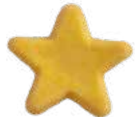
STAR ø 4,5 cm