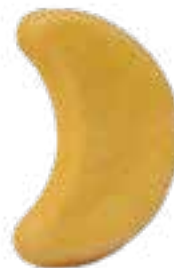
MOON ø 4,5 cm