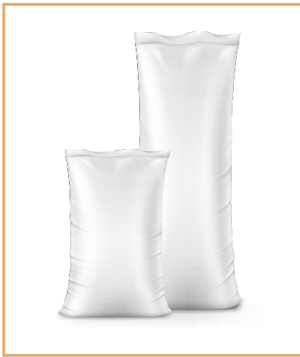
Bag 5g to 1kg

We can package our biscuits in bags of a weight starting from 5 grams. We assist our customer throughout all the phases of packaging design and realization by making available our technical and graphic departments. Besides, bags can be covered by riders or boxed too.