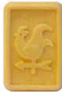
GOOD MORNING cm 3,5x5,5