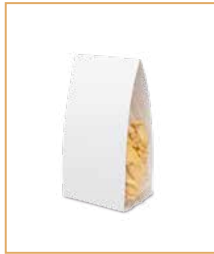
Bag with cardboard rider 200g to 1kg