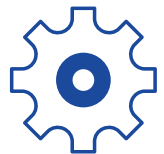
How It Works Leading Organization