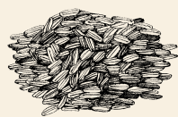
Brown Rice Protein