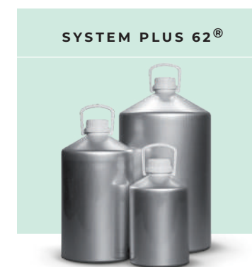
SYSTEM PLUS 62®