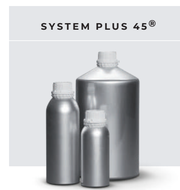
SYSTEM PLUS 45®