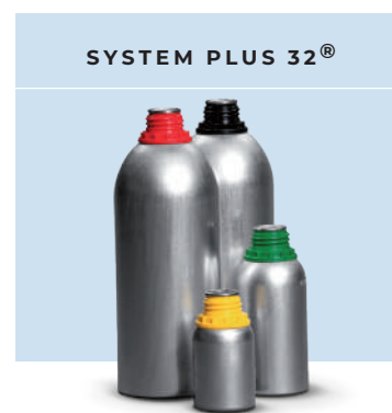
SYSTEM PLUS 32®