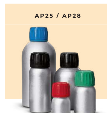
AP25 / AP28