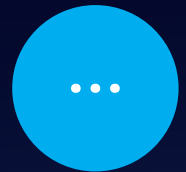
AND MANY MORE