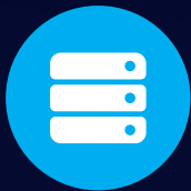
SERVER ROOM MONITORING