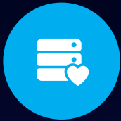
SERVER HEALTH MONITORING