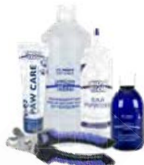
Health & Beauty

Progressive design and value for everyday use