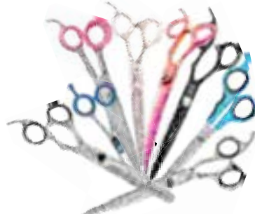
Scissors & Accessories