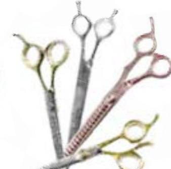
Scissors & Accessories