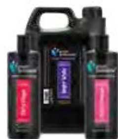
Shampoo & Conditioner