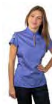
Short Sleeved Tops