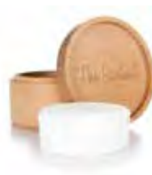
Chalks & Colours