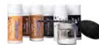
Chalk & Colours