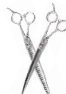
Ergo Line Series