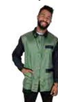
Male / Unisex Styles