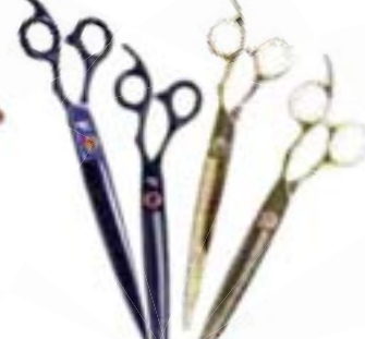
Scissors & Accessories