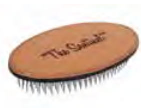
Rubber Brushes & Pads

Exclusive grooming tools for wire haired breeds