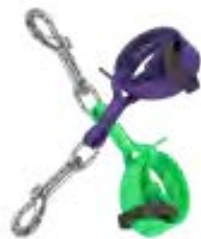
Safety Tether & Extender