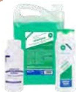
Shampoo & Conditioner