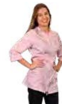
Long Sleeved Tops