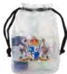
Triple Play Packs

Specialist products formulated for breed and coat type