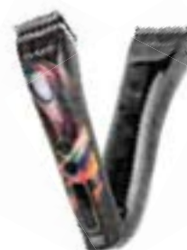
Clippers & Trimmers