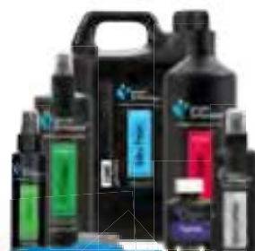
Colognes & Coat Care