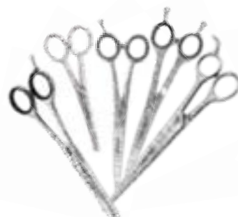
Scissors & Accessories