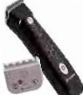
Motus Clipper & Accessories

Furrish is your retail ready home grooming range that stands at the forefront of home pet grooming, offering an extensive range of products designed to meet every need. By fostering a community of pet parents, Furrish shares essential grooming tips and encourages best practices for perfect at-home grooming sessions.