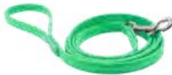
Collars & Leashes

Durable, flexible, fun loops, leashes and tools