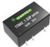
DC-DC Converters (SMD)