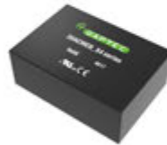
AC-DC Modules (Medical)