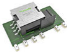
AC-DC Modules (Industrial)