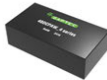
DC-DC Converters (Photovoltaic)