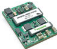
DC-DC Converters (Telecom powers)