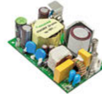
AC-DC Power Supply (Medical)