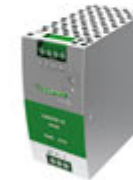
AC-DC DIN Rail (Industrial)