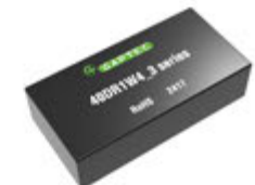
DC-DC Converters (Railway)