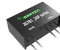
DC-DC Converters (THT)