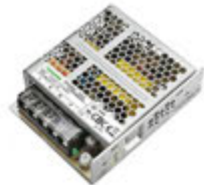
AC-DC Power Supply (Housing)