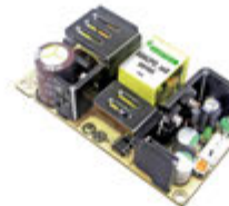
AC-DC Power Supply (Off board - Open frame)