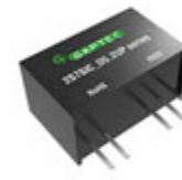
DC-DC Converters (IGBT & SiC)