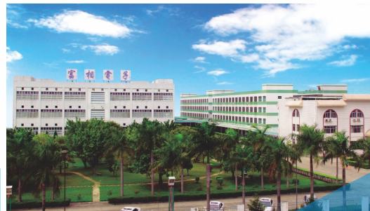
Dong Guan China