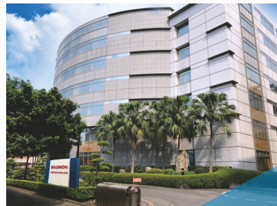
Taipei Taiwan Headquarter

Solomon Goldentek Display, a public listed company in Taiwan, has been a pioneering LCD/LCM manufacturer since 1989. The core competence includes the developing and manufacturing of TFT displays, monochrome LCD and LCD module. SGD displays have been used in various fields including automotive, industrial, medical, military and other applications.