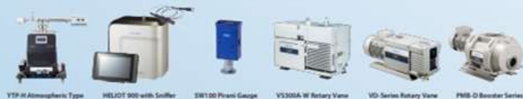
YTP-H Atmospheric Type HELIOT 500 with Sniffer SW100 Pirani Gauge VS300A-W Rotary Vane VD-Series Rotary Vane PMS-D Booster Series