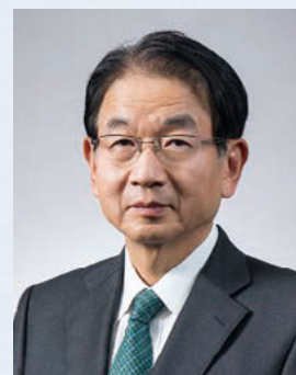
Representative Director, Chairman, President & CEO

Under the mission “Together with our global partners, we bring innovation to everyone everywhere”, we provide new value to our customers and beyond around the world and realize a prosperous society, as a valued partner of customers who seek unique and advanced SoCs to differentiate their new services and products, and suppliers of the latest technologies in the evolving semiconductor ecosystem.