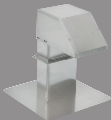
wall and roof inlets