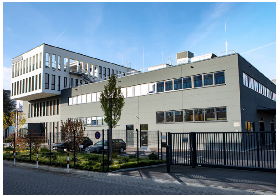
ERWEKA GmbH in Langen, Germany

ERWEKA customers around the world benefit from these decades of experience and the technologies we have developed.